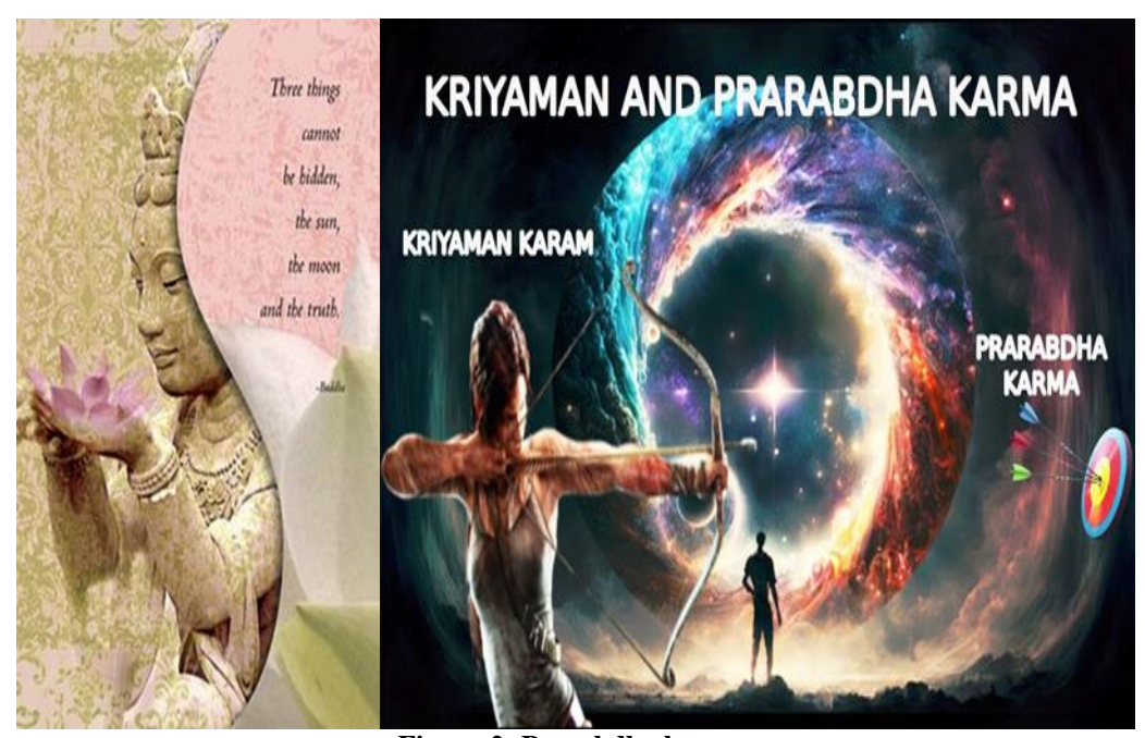
Figure-2: Prarabdha karma.

(without desire) and Parechha (due to others' desire). For a self-realized person, a Jivan mukta, there is no Ichha-Prarabdha but the two others, Anichha and Parechha, remain, which even a jivan mukta has to undergo. Sanchita Karma reminds us that our present circumstances are interwoven with the choices we've made in past, emphasizing the importance of mindfulness and ethical behavior. Prarabdha Karma teaches us acceptance and resilience, as we navigate the effects of past actions with grace and understanding. Pending Karma or Prarabdha can be seen from many ways. It can be seen from Rashis or Signs and it can also be seen from the Nakshatras. Primarily, we need to check the 6th House and the position of that planet in the 6th House, the 6th Lord to see the pending Karma, I also see the retrograde planets for pending Karma. Prarabdha can be overcome by kriyaman-karma, meaning the efforts. Intense yearning is the key to spiritual practice. If there is yearning, God definitely helps in some form or the other. It eliminates the obstacles that obstruct spiritual progress.