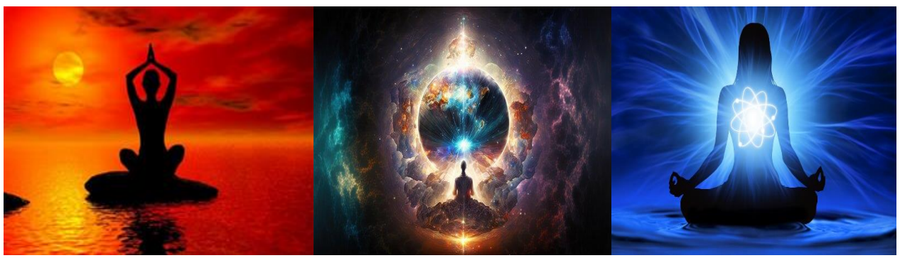
Figure-4: Karma yoga, Bhakti yoga, Jnana yoga.

done. 3. Check your motives: and make sure they come from a place of love for self and others. 4. Watch your attitude: because negative thoughts create angry energy directed at you. 5. Forgive: It can be the hardest thing to do, but the most important in creating great karma. Panchatatva (panch + tatva) means five elements or "panchamahabhutas". These are: Prithvi (Earth), Jal (Water), Agni (Fire), Vayu (Air) and Akash (Space). The whole universe is created from these five elements. Prarabdha Karma cannot be overcome. It's fruits bitter or sweet has to be experienced!