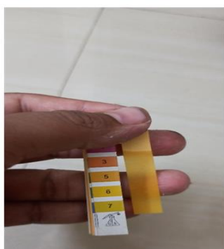
pH TESTS: -6.5