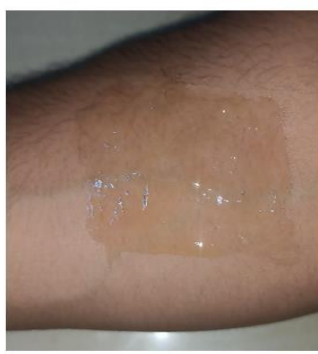
PEEL OFF TESTS