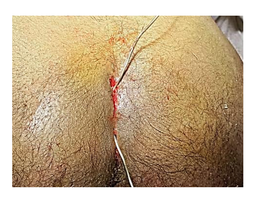
2% was infiltrated around the sinus tract.

Probing was done (copper probe was used) through the 3<sup>rd</sup> opening towards the least path of resistance which was directed downwards towards the openings of two and one.