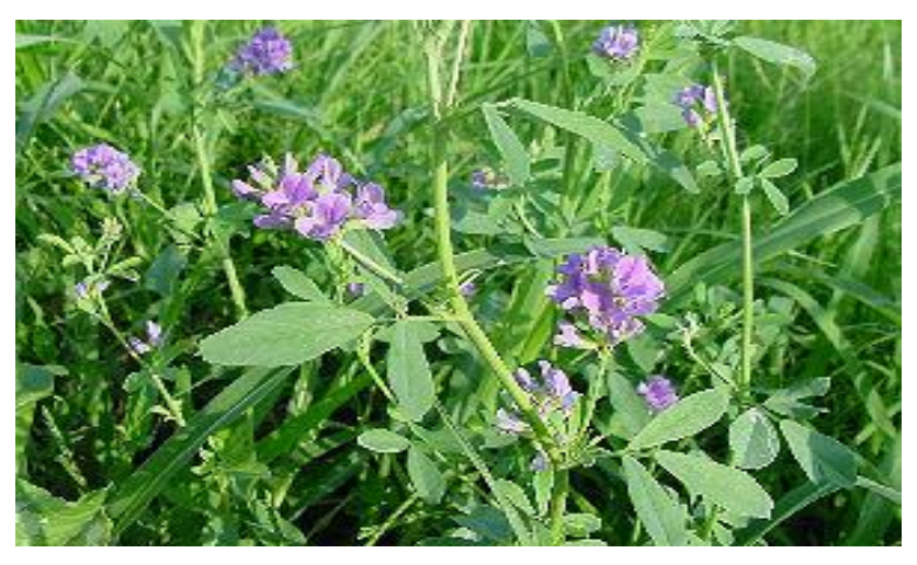
Fig. 1: Medicago sativa<sup>[3]</sup>