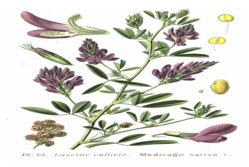
Fig 2: Medicago sativa. [4]