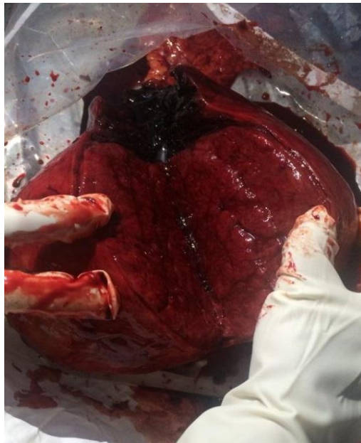
Figure 2: The fibromatous nature of the mass.

Anatomopathological study confirmed the ovarian origin and the fibromatous nature of the mass