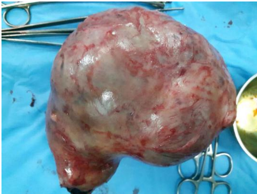
Figure 2: the ovarian mass after the conservative surgery.

The surgery confirmed the aplasia of the uterus and the kidney. The origin of the mass was ovarian. A conservative treatment was done with an excision of the mass (figure 2,3).