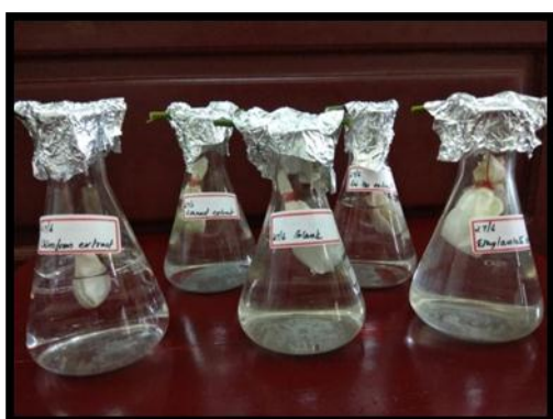
Photo 6: Set up for invitro anti-urolithiatic assay and incubated condition.