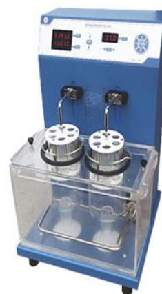
Figure 4: Disintegration test apparatus.

Disintegration is a method to evaluate the rate of disintegration of solid dosage forms. Disintegration is defined as the breakdown of solid dosage form into small particles after it is ingested. The shell pieces after disintegration may agglomerate forming large mass of gelatin taking more time to dissolve and may adhere to the mesh thus blocking the holes. Disintegration tester is a solid state instrument for the accurate estimation of disintegration time.