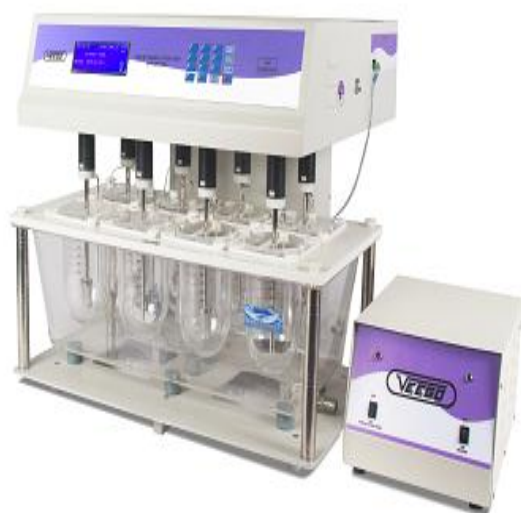
Figure 5: Dissolution test apparatus.