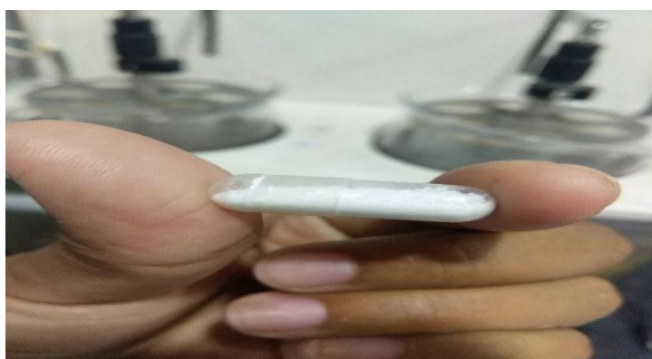
Figure 1: laboratory made hard gelatin capsule with granules and PCM as active ingredient.