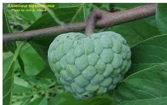
Fig. 1: Annona Squamosa Plant.

Annona Squamosa was native to the tropical Americas and West Indies, but the exact origin was unknown. It was now the most widely cultivated of all the species of Annona , being grown for its fruit throughout the tropics and warmer subtropics, such as Indonesia, Thailand, and Taiwan; to southern Asia before 1590 as shown in Fig.1.