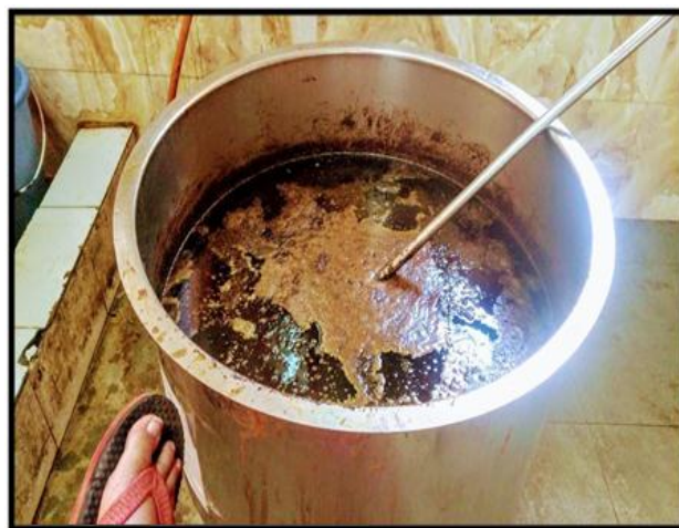
Appearance of Ghee on Top of the Vessel

Vacha-Haridradi Gana Siddha Ghrita was prepared in Parul Ayurved College Pharmacy as per the Classical Preparation of Ghee mentioned by Acharya Sharangadhar in Sharangadhara Samhita, Madhyama Khanda , 9 th Chapter – Sneha Kalpana . [3]