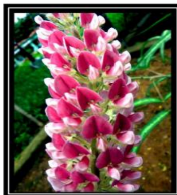
Uraria picta Flower

Latin Name: Uraria picta Desv. ( Hedysarum pictum Jacq.)