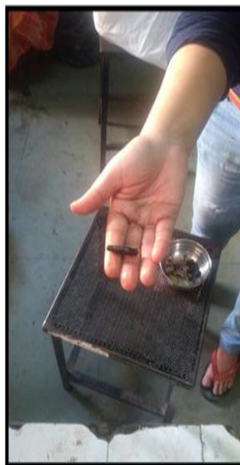
Appearance of Sneha Siddhi Lakshanas