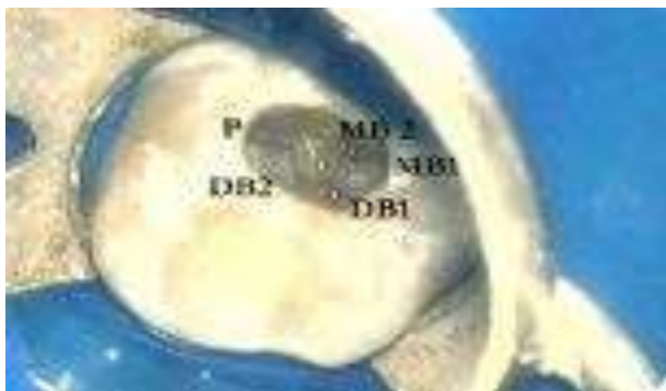
Fig. No. 2: Access opening showing 5 orifices in relation to 16.