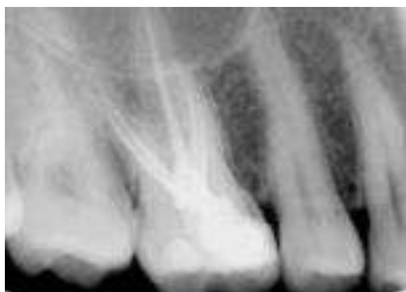
Fig. 5: Obturation done in relation to 16.