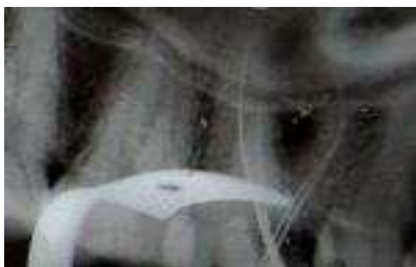
Fig. No. 3: Working length determination in relation to 16.