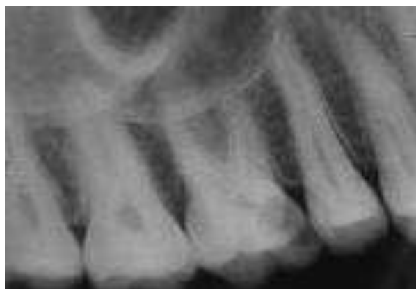
Fig. No. 1: Preoperative IOPA showing caries with pulp involvement in relation to 16.

Irrigation was done using normal 5 ml of 3% NaOCl (Shiva Products, Waliv, Palghar, Maharashtra, India) as an irrigant followed by 5 ml of normal saline solution after each instrumentation. Final irrigation was done with 2% chlorhexidine for final flush. The canals were dried with absorbent points (Dentsply Maillefer) and calcium hydroxide closed dressing was given and tooth was sealed with IRM cement (Dentsply Maillefer). One week later, at the third appointment, all canals were irrigated using sterile normal saline followed by 10ml of 17% liquid EDTA and dried with absorbent paper points (Dentsply Maillefer), and obturation was performed using gutta-percha (Dentsply Maillefer) and AH Plus resin sealer (Maillefer, Dentsply, Konstanz, Germany) (Fig.5). The obturated tooth was then restored with a posterior composite resin (P60; 3M Dental Products, St Paul, MN). The patient was advised a full-veneer crown. Follow-up evaluation at 6 months and 1-year was done which showed satisfactory results.