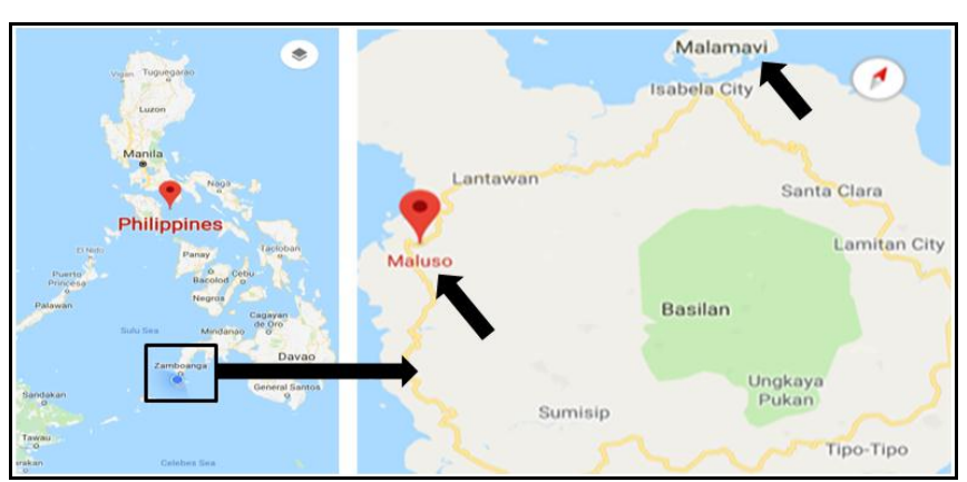
Figure 1: The location of Malamawi and Maluso in Basilan, Philippines.

Description of the study sites: The study was conducted at the market of Isabela City, Basilan, Philippines, where the " imbao " ( Anodontia edentula ) is sold from the fishermen down to the consumers. The location of the study site is 1.7 km from the wharf of Isabela. The site can easily be accessed by fast craft or ferry boat either to Isabela or Lamitan City in Basilan. It takes about 45 minutes to 1 hour and 15 minutes the reach these places. The island is just small and places there are easy to locate (Figure 1).