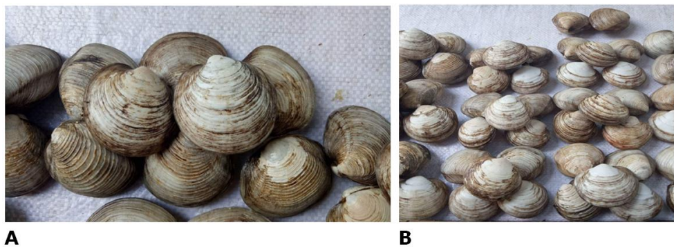
Figure 3: Male (A) and female (B) Anodontia edentula.

Figure 4 shows that there was a difference of the prices of Anodontia edentula coming from Malamawi and Maluso, Basilan Province. In Malamawi, the price was Php. 4.50 for the large Anodontia edentula in 2015. In Maluso the price was Php. 3.00 for the large Anodontia edentula in 2015. In Malamawi, the price was Php. 5.50