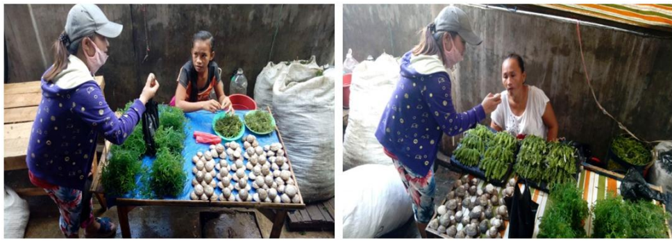
Figure 2: Vendors of Anodontia edentula in Isabela City Market.