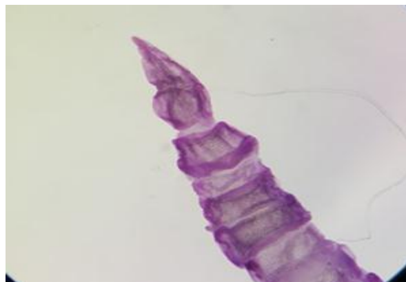
Fimbriarioides intermedia , scolex (4x).

Africana in south Africa from Anatida family ( A.nascapensis , A. Undulata ) with percentage of infection 50% and intensity (5). Differs from genus of current study F. intermedia in number of testis, having 2 testis per proglottids . The cirrus pouch posterior to vitelline glands. (Geranga, 1976) Isolated another species of the genus F. tadornae from Sheldrake bird in central of Kazakhstan and describe the period between the oncospher invasion and reach to cysticercoids was 12-13 day, the author also studied the environmental factors such as temperature and misty that effects on this process.