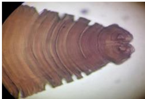
Diplogynia oligorichis, scolex (4x).

Himanleptidae, including four species D. anestrini , D. acuminatum , D. americans , D. oligurichs . Bear, (1969) isolated this parasite from Anatida (geese and ducks) in Australia, another species D. acuminatom , which described depending on absence of row hooks and the measured of rostellum (0.077- 0.097), this disagreement with genus of current study (0.057- 0.098). Classified genus D. oligurichs depend on length of hooks, presence of crystalline rods in each side of body from the interior proglottids to terminal segment and this agreement with description of ( Willeres and Olsen, 1969; Yamagutti, 1959; Czaplinski and Ryzikov, 1966).