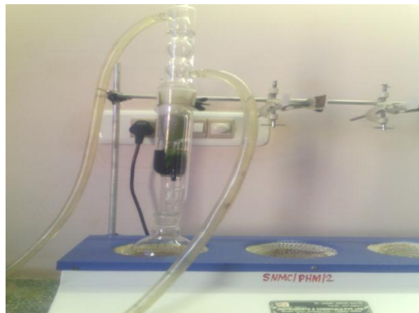
Figure 3: Soxhlet Apparatus.

evaporated to dry at 60°C. Flower powder (20 g) of Vitex negundo yielded 4 g of crude extract. The solid residues were stored in airtight container and preserved in the refrigerator at -20°C. [15] From this stock, fresh preparations were obtained whenever required.