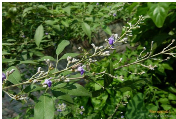
Figure 1: Vitex negundo Linn.

relaxant. [14] Very few studies have been done to evaluate its anticonvulsant activity and no study was done on anticonvulsant activity of flowers of Vitex negundo . Therefore, the present study was undertaken to investigate anticonvulsant activity of ethanolic extract of flowers of Vitex negundo .