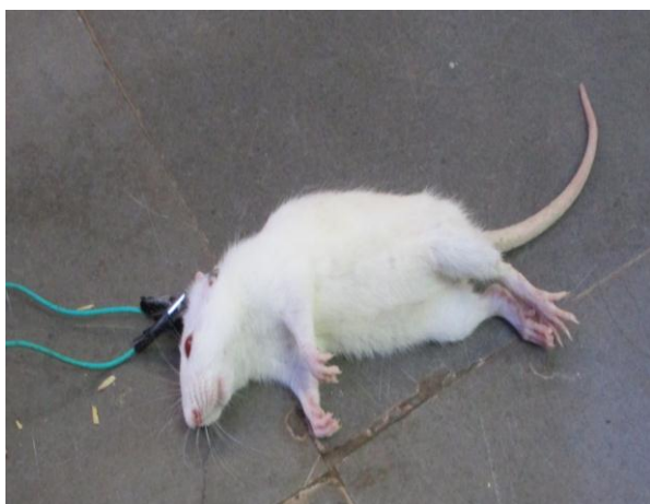
Table 1: Time duration of phases of MES – induced convulsion.