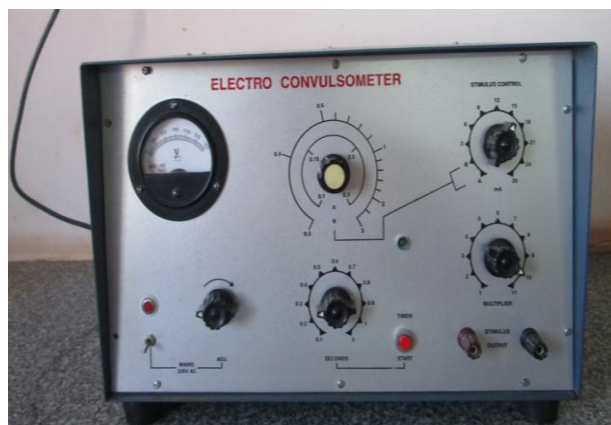
Figure 2: Electroconvulsimeter.

Instruments: Electroconvulsimeter (Figure 2), Digital weighing balance, Stopwatch, ear electrodes, Feeding tube, Insulin syringe, Mouth gags, Tuberculin syringe, Ryle's tube, beaker, glass jar, glass rod.