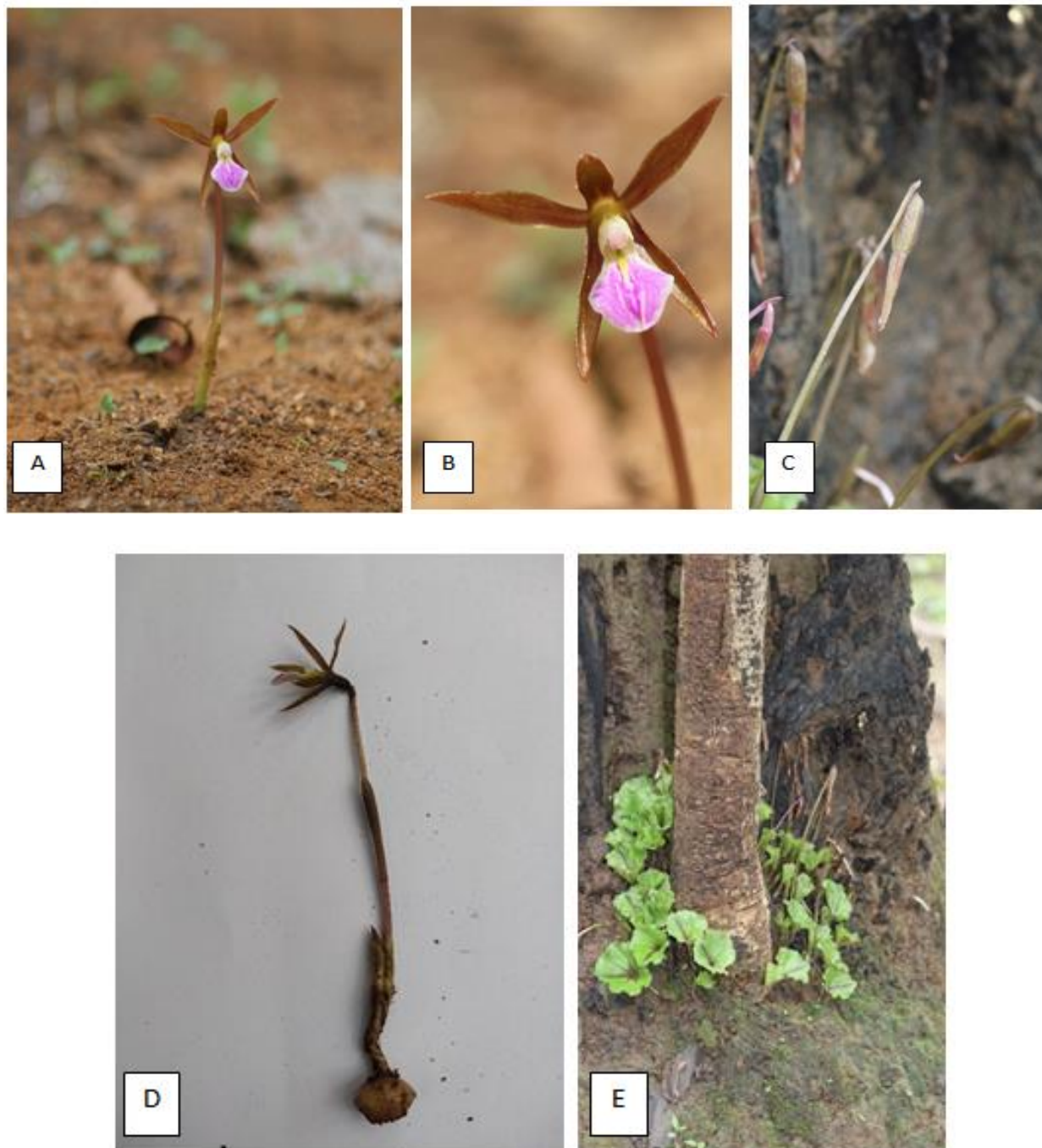
Photo plate 1: A) Flowering stage B) Close-up of flower C) Fruiting Stage. D) Collected full Plant Specimen E) Natural Habitat with Leaves.

Distribution: India (Arunachal Pradesh, Uttarakhand, Odisha, Andhra Pradesh, Maharashtra, Karnataka, Kerala, Tamil Nadu Jharkhand), Myanmar, Indonesia, Malaysia, Thailand, Laos.