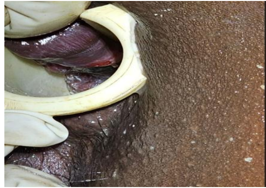
Pratisaraniya kshara karma