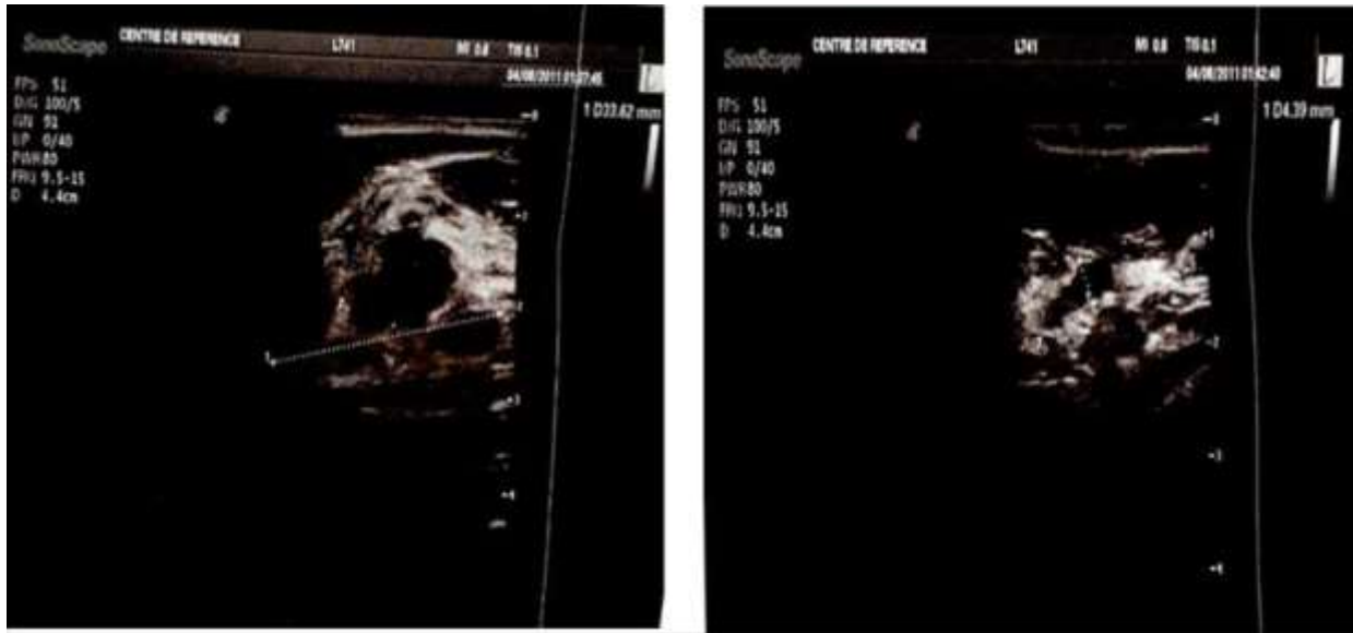
Figure 2: Ultrasound Showing the Lesion in The Superior-Internal Quadrant.