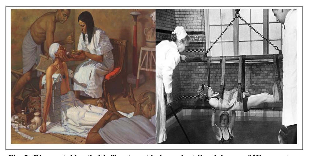
Fig. 3: Rheumatoid arthritis Treatment in in ancient Greek in era of Hippocrates.

of heat), cupping etc. were used. After several failed treatments that did not improve the condition of the patients, came the use of heavy metals in treatment of many diseases including rheumatoid arthritis. Gold, bismuth, arsenic and copper salts were used with varying rates of success. Gold however has shown success over years of use and is still a part of Disease Modifying Antirheumatic drugs (DMARDs). DMARDs are widely used in treatment of Rheumatoid arthritis.