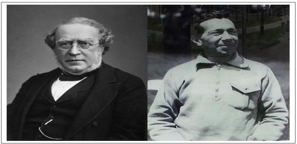
Fig. 2: A B Garrod in 1858 & Hollander in 1949.

A B Garrod in 1858 named the disease rheumatoid arthritis replacing the old terms arthritis deformans and rheumatic gout. He is thus credited to make a distinction between rheumatoid arthritis and osteoarthritis and gout.