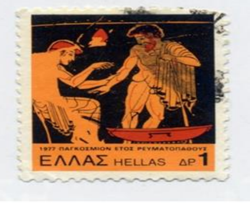
Fig. 1: Ancient Greek Therapy for Arthritis.