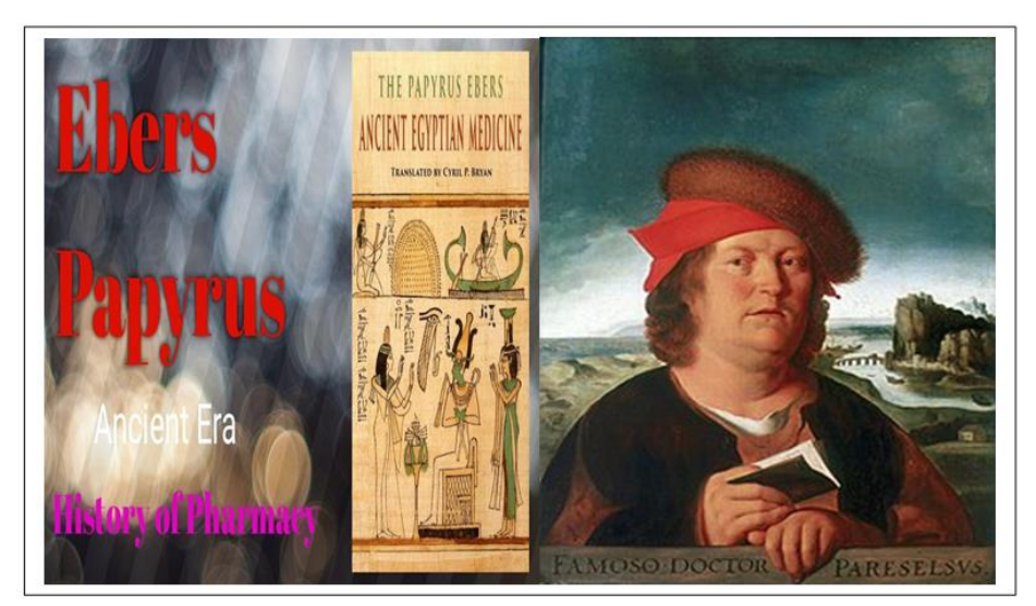
Fig. 5: Rheumatoid arthritis- History in papyrus.

Ibn-e-Sina describes Waja-ul-Mafasil, as a clinical condition marked by pain and stiffness in one or more joints brought on by the accumulation of ratubate-ghariba (foreign humour) in the joints. [18] Zakariya Razi states that "Waja-ul-Mafasil" is a condition that manifests itself as repeated or paroxysmal episodes and is brought on by the accumulation of exaggerated fluid within the joint. He considered that gout, Irq-un-nisa (sciatica), and Waja-ul-Mafasil all belongs to the same genus of disease. [20] Ismail Jurjani described waja álmafasil as such when morbid matter builds up in the organs of the joints and causes discomfort and inflammation. [19]