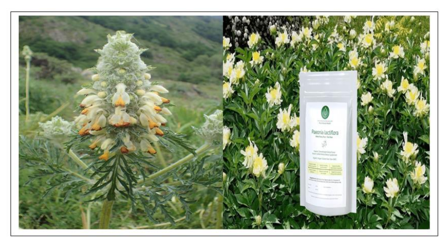
Fig. 7: Eremostachys laciniata & Paeonia lactiflora in the Treatment of Rheumatoid arthritis.

Decoctions of the roots and flowers of the Iranian herb, Eremostachys laciniata, is usually given to alleviate inflammatory conditions, including arthritis.