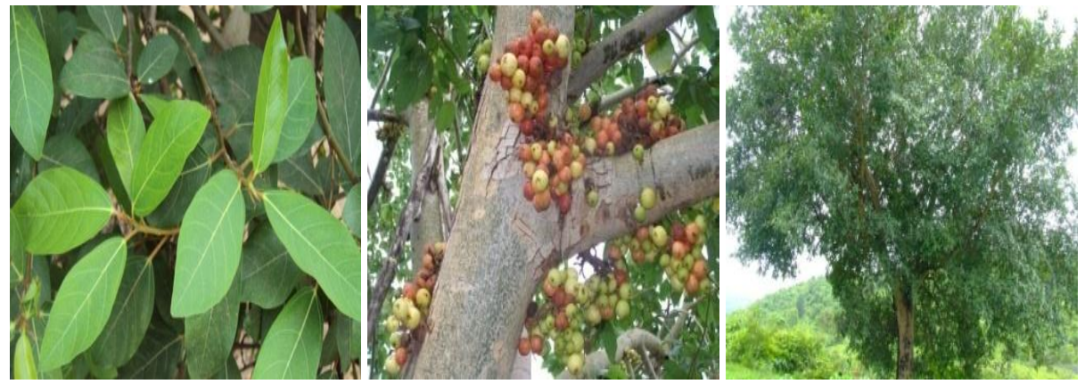
Leaves of Ficus racemosa

The height of the plant is upto 18 meter; leaves are ovate, ovate-lanceolate, elliptic, subacute, entire and petiolate. Leaves shade in December replenish in January and April. when tree becomes bare in that short period fig pyriform, fruits become red when ripe. This plant is seen dwelling in areas up to 1200 m altitude on hilltop. These plants require well-drained medium to heavy soils for its cultivation. Plant propagation is normally done by cuttings of stem and root suckers, seeds can also be used for propagation.<sup>[2]</sup> Pollination is done by very small wasps. It has evergreen leaves, if it is close to a water source.