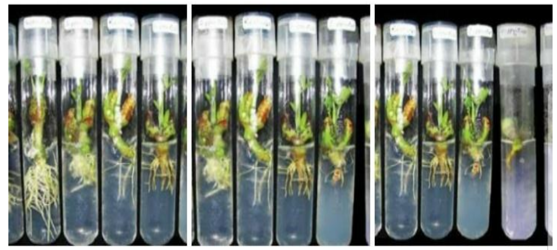
Figure 03: Seed germination on water agar test tube after 15th day in SM-008.