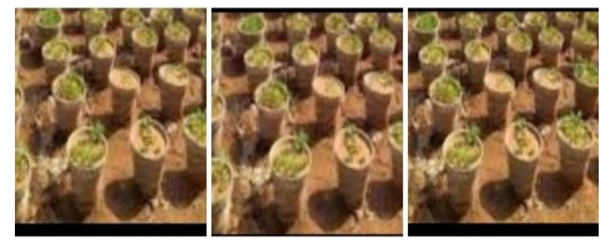
Figure- 05: Seed germination on pot experiment after 30 day in SM-008.

than 30 days, Results are showing the percentage of seed germination was observed 80, 66, 58% in the sample of SM-008 and in the sample of SM-013 the percentage of seed germinations are found 79, 68 and 60% in SM-013 respectively in the categories of asymptomatic (general), moderate (medium) and deeply discoloured (deeply infected).