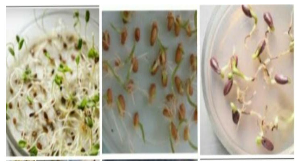
Figure- 02: Seed germination on petriplate after 8th day of incubation in SM-013.

All seeds which are not able to germinate are showing brownish, rotting and oozing of contaminate pathogen. In the sample of SM-008 seedling mortality have been found 3, 3 and 4% and in sample of SM-013 seedling mortality have been observed 1, 4 and 6% respectively in the categories of asymptomatic (general), moderate (medium) and deeply discoloured (deeply infected).