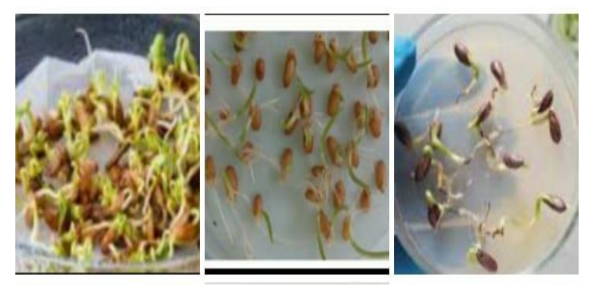
Figure- 01: Seed germination on petriplate 8th day of incubation in SM-008.