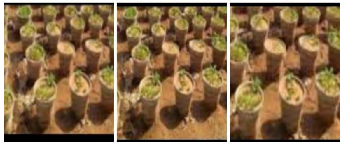
Figure- 06: Seed germination on pot experiment after 30 day in SM-013.