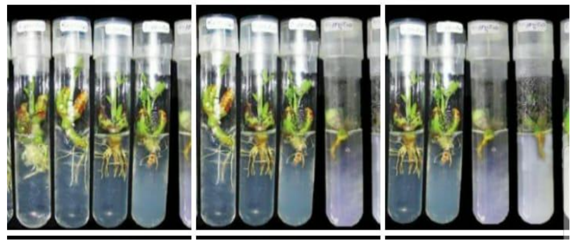
Figure- 04: Seed germination on water agar test tube after 15th day in SM-013.

In deeply discoloured seeds has found highest percentage of mortality in the compare of other two types in the samples of SM-008 and SM-013.