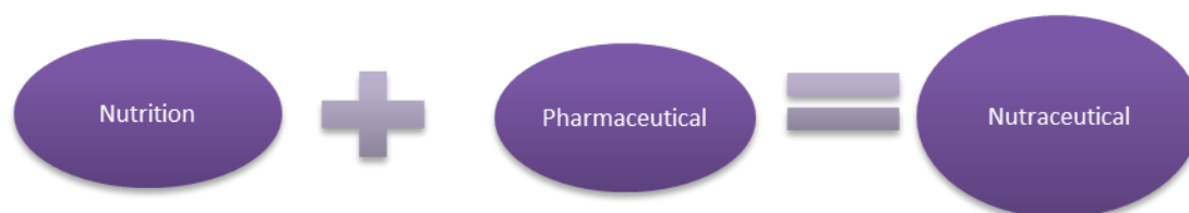
Fig 1. Term Nutraceuticals.

development of medical problems like cardiovascular disease, diabetes, gallstones, neurodegenerative disorders, cataract, and so many others. [1] A number of different types of pathological conditions with a highly complex aetiology make up neurological illness. [2] In 1989, DeFelice merged the terms "nutrition" and "pharmaceutical" to develop the terminology "nutraceutical," which again was initially defined as "a food (or edible part of the plant) that provides health or relevant information, including the diseases prevention and/or treatment (figure 1)." [3]