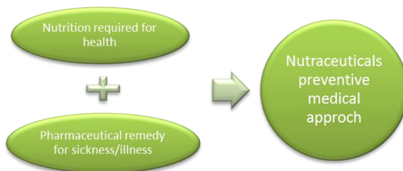
Fig 2. Concept of nutraceutical benefit.

The earliest civilizations that provided proof of the efficient utilisation of food products. Indians are also affected by medical treatment and ailments and a fact that has even been supported for 5000 years by Ayurveda, Sumerians, Egyptians, and Chinese also. [8] The significant potential for both plant-based and animal-based nutraceuticals good chance for the food industries to develop new foods goods in the future. Studies on nutrition are now starting to focus on the Foods' abilities to protect against illness and prevent disease are explored [9] isolated nutrients, herbal items, nutritional supplements, and diets are instances of nutraceuticals. "Designer" meals and processed goods, like cereals, soups, and drinks, that have undergone genetic engineering. Definitely, many of these compounds have important physiological properties and beneficial to biological systems. [10]