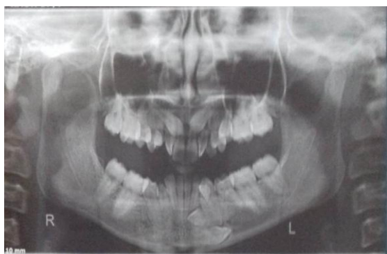
Fig. 6: OPG showing impacted and transmigrated canines and missing teeth.

Orthopantomogram (OPG) examination revealed right and left permanent impacted canine in maxillary arch. Both mandibular permanent canines were horizontally impacted on left side of mandibular arch. All four third molars and right and left side second mandibular premolars were found to be missing from OPG examination (fig.6).