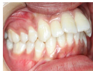
Fig.9: Intraoral frontal view.