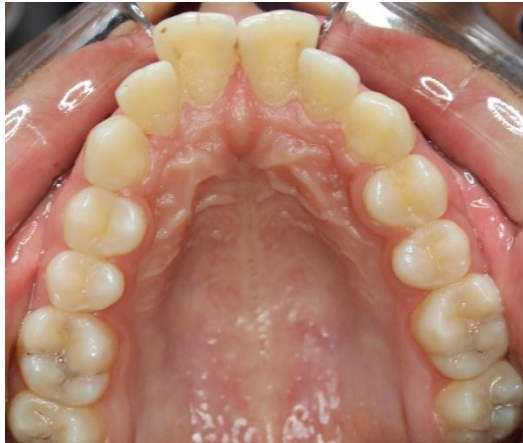
Fig.10: Intraoral maxillary occlusal view.