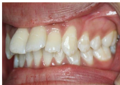
Fig.8: Intraoral left side view.