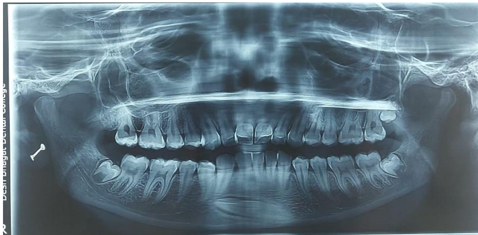
Fig.12: OPG showing impacted and transmigrated left canine.