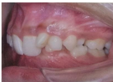
Fig.2: Intraoral left side view.