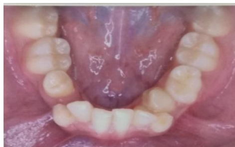
Fig.5: Intraoral mandibular occlusal view

From medical history it was reported that patient is healthy with no systemic problem or syndrome. Also there was no family history for the similar condition. Extra orally Patient had straight, pleasing profile.