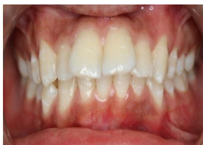
Fig.7: Intraoral right side view.

Orthopantomogram (OPG) examination revealed impacted mandibular left canine which has migrated to right side of arch. It was present near the border of mandible crossing the midline and below the roots of incisors and right canine. Maxillary right third molar was also missing. (Fig.12).