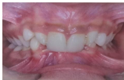
Fig.3: Intraoral frontal view.