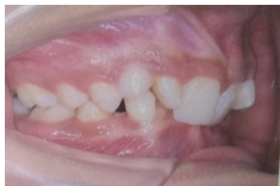
Fig.1: Intraoral right side view.