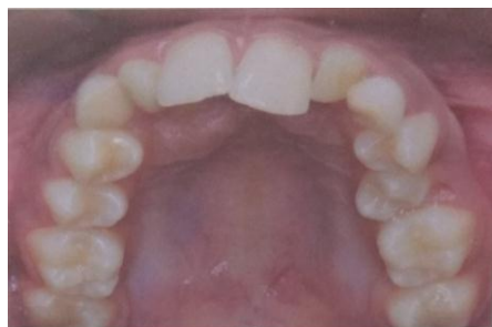
Fig.4: Intraoral maxillary occlusal view.