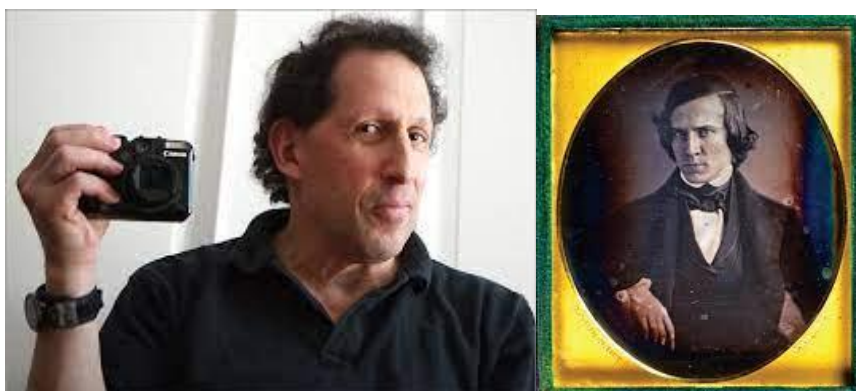
Figure-2: Father of Selfie & Inventor of Selfie.