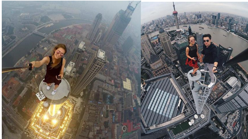
Figure-4: Dangerous Selfie.