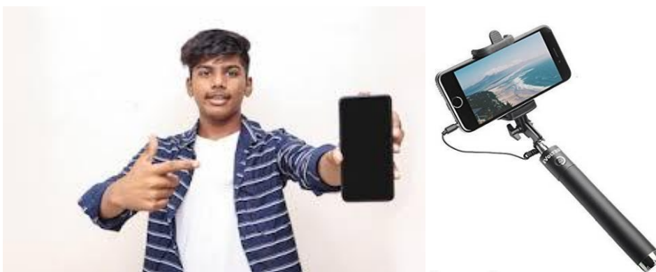
Figure-3: Selfie & Selfie Stick.

A "usie" is a group selfie, where someone takes a picture of themselves with other people in the shot. Isn't that just