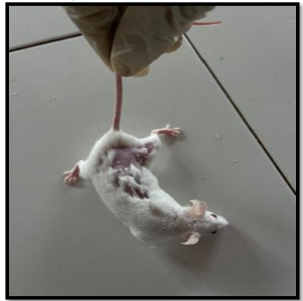
Figure 1: Skin irritancy test on mice.

Skin irritancy was conducted and observed that the optimum formulation 3. Do not show any lesions or irritation/ redness.