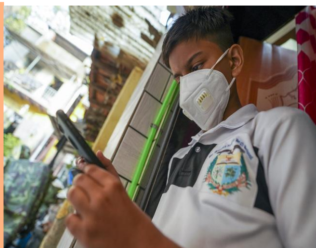
Figure-1: Digital vaccine.