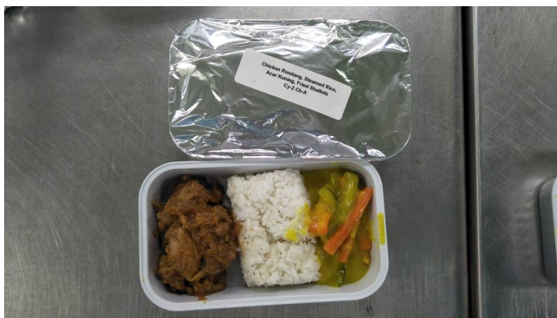
Figure 2: Chicken Rendang Packaging.

food was in accordance with the critical limit that had been set, which was 13C. Thus, Chicken Rendang at the time of portioning was still safe for consumption. The cause of high room temperature was because of damage on the compressor. The solution for this was to send a WO (Who Order) to the Engineering department to solve this matter. Chicken Rendang packaging can be seen in Figure 2.