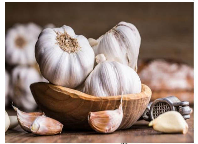
Fig. 1: Garlic<sup>[8]</sup>

nectar of the gods, camphor of the poor, poor man's treacle, and clove garlic". ^{[6]}