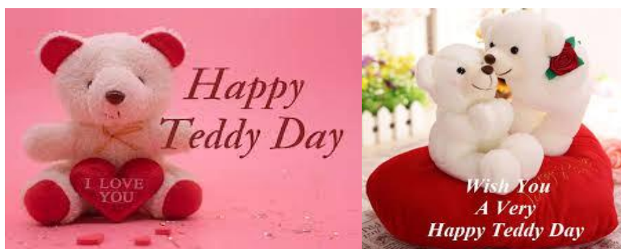
Figure-6: Teddy Day.

February 9, the world celebrates Chocolate Day. This is different from the World Chocolate Day observed on July 7 to commemorate the chocolate's introduction to Europe in 1550. The celebration of Chocolate on February 9 is a part of the festivities surrounding Valentine's Day celebrated on February 14.