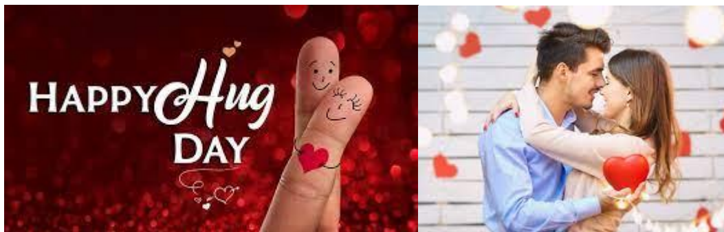
Figure-8: Hug Day.

each other and their relationship. I promise to love you forever! [7] Promise me that you will never leave me alone. I promise to never ever abandon you at any point in life. ... You bring the best out of me. ... I promise that I'll never make you feel alone. The sixth day of this week, 12 February is celebrated as Hug Day.