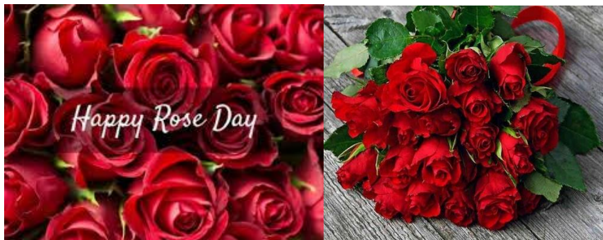
Figure-3: Rose Day.

Days classified: Rose Day [1 st day], Propose Day [2 nd day], Chocolate Day [3 rd day], Teddy Day [4 th day], Promise [5 th day], Hug Day [6 th day], Kiss Day [7 th day] and finally Valentine's Day.