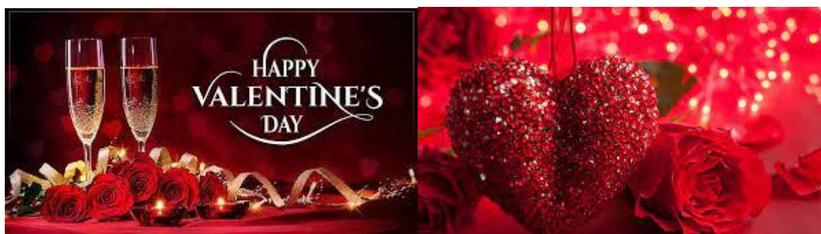
Figure-10: Valentine's Day.