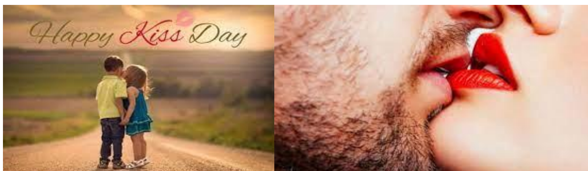
Figure-9: Kiss Day.

year on February 13, a day prior to Valentine's Day. An adorable kiss to your special ones can make them feel cared for, loved, pampered, and admired. [8]