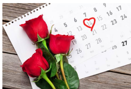
Figure-1: Most expected day for couples.

Saint Valentine (Italian: San Valentino; Latin: Valentinus) was a 3rd-century Roman saint, commemorated in Western Christianity on February 14 and in Eastern Orthodoxy on July 6. From the High Middle Ages, his Saints' Day has been associated with a tradition of courtly love. He is also a patron saint of Terni, epilepsy and beekeepers. Saint Valentine was a clergyman — either a priest or a bishop — in the Roman Empire who ministered to persecuted Christians. [1]