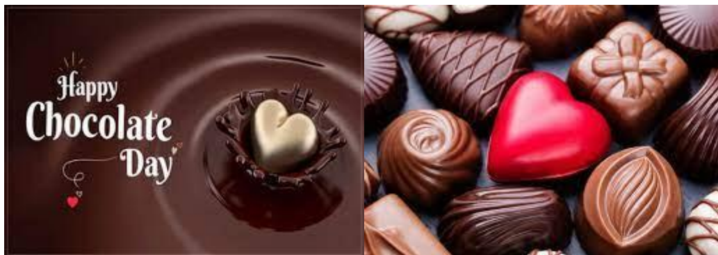
Figure-5: Chocolate Day.

Propose Day falls on Tuesday, February 8. As the name suggests, on this day, people express their sincere feelings to their partner or someone they have a crush on. [5]