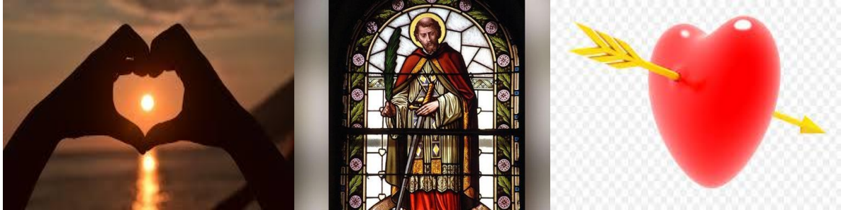
Figure-2: Love, St. Valentine, Passion.

and commercial celebration of romance and love in many regions of the world. Valentine's week comprises Rose Day, Propose Day, Chocolate Day, Teddy Day, Promise Day, Hug Day, Kiss Day, and Valentine's Day. Valentine's Week is upon us, beginning on February 7 with Rose Day and culminating on February 14. On this Rose Day, I ask God to fill your path with beautiful red roses and remove all thorns from your life. Happy rose day! You are the rose of my life! Happy rose day! [2]