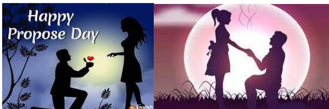
Figure-4: Propose Day.

relationship more beautiful than the most precious rose in the world. Happy Rose Day, my love! 2. Your soul is as beautiful as a rose and I love you immensely. [4]