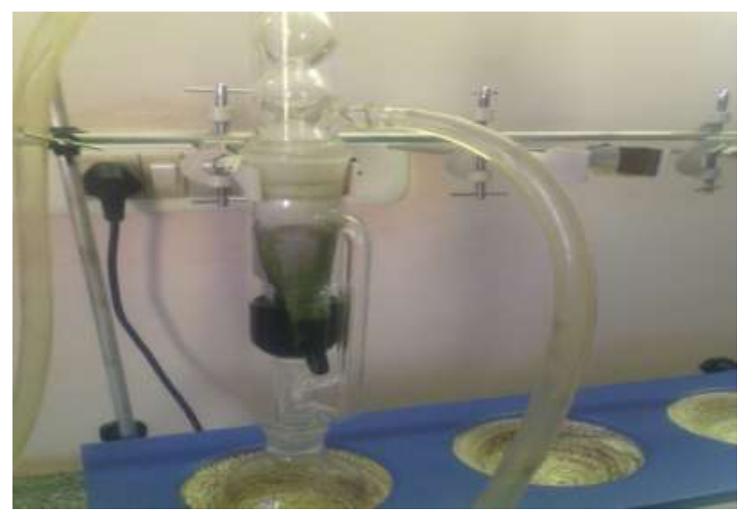
Figure – 2 Extraction of Momordica tuberosa leaves using Soxhlet appartus

The leaves of the plant were dried under shade for a period of 2 weeks. The dried leaves were milled to a fine powder. The material was extracted with 80% ethanol using soxhlet extraction apparatus and it was evaporated to dry at 60°C. Dried leaves (20 g) of Momordica Tuberosa leaves yielded 4 g of crude extract. The solid residues were stored in airtight container and preserved in the refrigerator at -20^{\circ} C.<sup>[14]</sup> From this stock, fresh preparations were obtained whenever required.