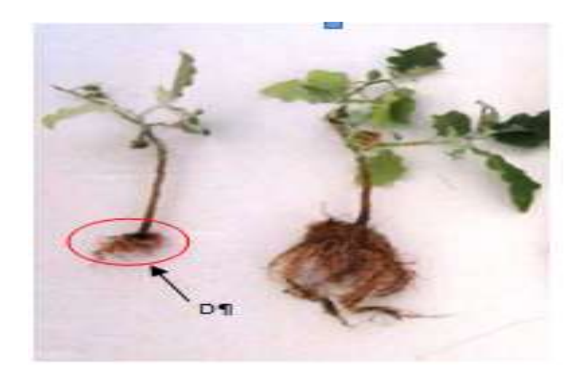
Figure 3: Effect of Fusarium oxysporum f. sp. albedinis on the development of aerial and root part of the eggplant. D: root system reduction