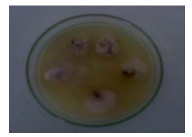
Figure 4. Culture of Fusarium oxysporum f.sp. albedinis on PDA.