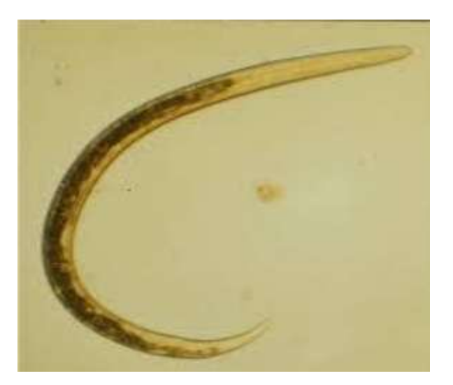
Figure 1: Dictyocaulus fillaria lung worm of sheep and goats.

Dictyocaulus viviparous approximately 35x85 micrometers. They have ovoid shape and contain a fully developed L_1 Dictyocaulus larva (Janquera, 2014). Adult Muellerius capillaris are medium-sized (not longer than 3 cm) and thin worms (hence their common name hairworms), while adult Protostrongylus rufescens are slender, reddish to brownish color worms up to 70 mm (Janquera, 2015a & b).