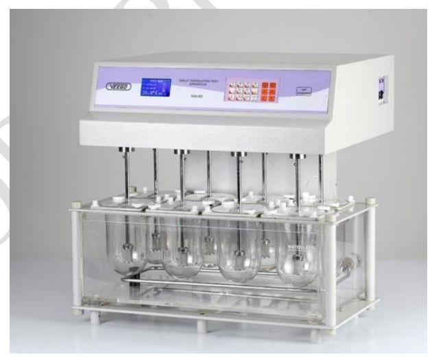
Figure-4: Dissolution test.

Dissolution Test: The BP or USP dissolution apparatus (Basket apparatus) consist of a cylindrical vessel with a hemispherical bottom, which may be covered, made of glass or other inert, transparent material; a motor; a metallic drive shaft; and a cylindrical basket. The vessel is partially immersed in a suitable water bath of any convenient size or heated by a suitable device such as a heating jacket. The water bath or heating device permits holding the temperature inside the vessel at 37±0.5°C during the test and keeping the bath fluid in constant, smooth motion. For this test according to BP and PhEur place the stated volume of the dissolution medium (± 1 %) in the vessel of the specified apparatus. Assemble the apparatus; equilibrate the dissolution medium to 37±0.5°C. Place 1 tablet in the apparatus, taking care to exclude air bubbles from the surface of the tablet. Operate the apparatus at the specified rate. Within the time interval specified, or at each of the times stated,