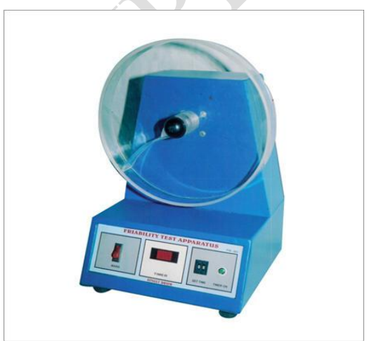
Figure-6: Tablet Friability Tester.

Where, IW=Total Initial weight of tablets; Fw=Total final weight of tablets. As stated by USP if conventional compressed tablets that loss less than 0.5 % to 1 % (after 100 revolutions) of their weight are generally considered acceptable. [8]