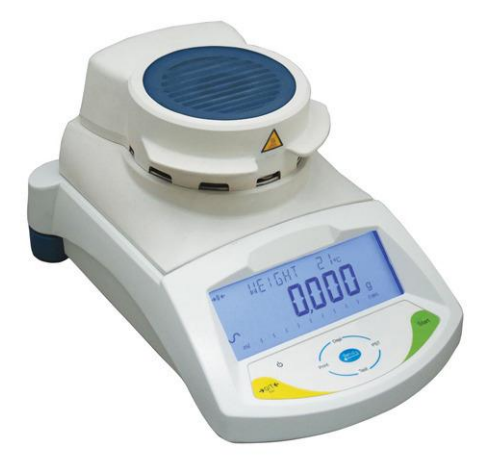
Figure-2: Weight measurement instrument.

Weight Variation Test: According to the USP weight variation test is run by weighting 20 tablets individually calculating the average weights and comparing the individual tablet weights to the average. The value of weight variation test is expressed in percentage. The following formula is used: Weight Variation=(Iw-Aw)/Aw×100%. Where, IW=Individual weight of tablet; Aw=Average weight of tablet. As per USP the tablet complies with the test if not more than 2 of the individual masses deviate from the average mass by more than the percentage deviation. [4]