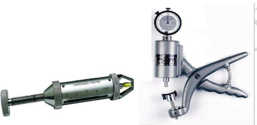
Figure-5: Tablet Hardness-Tester and Pfizer tester.

Hardness Test: For this test one of the earliest testers was Ketan tablet hardness tester, which is a type of the Monsanto hardness tester to evaluate tablet hardness tester. The tester consists of a barrel containing a compressible spring held between two plungers. The lower plunger is placed in contact with the tablet and zero reading is taken. The upper plunger is then forced against a spring by turning a threaded bolt until the tablet fractures. As the spring is compressed, a pointer rides along a gauge in the barrel to indicate the force. The force of fracture is recorded in kilogram. [7]