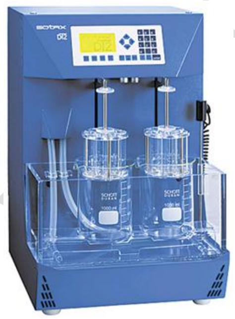
Figure-3: Tablet Disintegration tester.

Weight Variation Test: According to the USP weight variation test is run by weighting 20 tablets individually calculating the average weights and comparing the individual tablet weights to the average. The value of weight variation test is expressed in percentage. The following formula is used: Weight Variation=(Iw-Aw)/Aw×100%. Where, IW=Individual weight of tablet; Aw=Average weight of tablet. As per USP the tablet complies with the test if not more than 2 of the individual masses deviate from the average mass by more than the percentage deviation. [4]