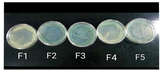
Figure 3: Growth of bacteria after plasmid curing.