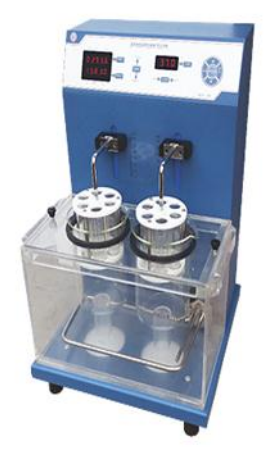
Figure 4: Disintegration test apparatus.

Disintegration is a method to evaluate the rate of disintegration of solid dosage forms. Disintegration is defined as the breakdown of solid dosage form into small particles after it is ingested. The shell pieces after disintegration may agglomerate forming large mass of gelatin taking more time to dissolve and may adhere to the mesh thus blocking the holes. Disintegration tester is a solid state instrument for the accurate estimation of disintegration time.