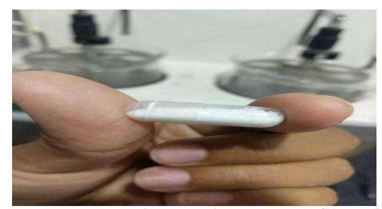
Figure 1: laboratory made hard gelatin capsule with granules and PCM as active ingredient.