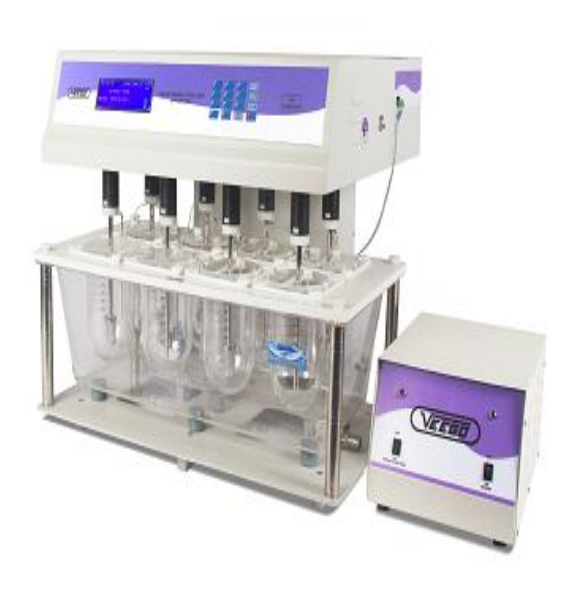
Figure 5: Dissolution test apparatus.