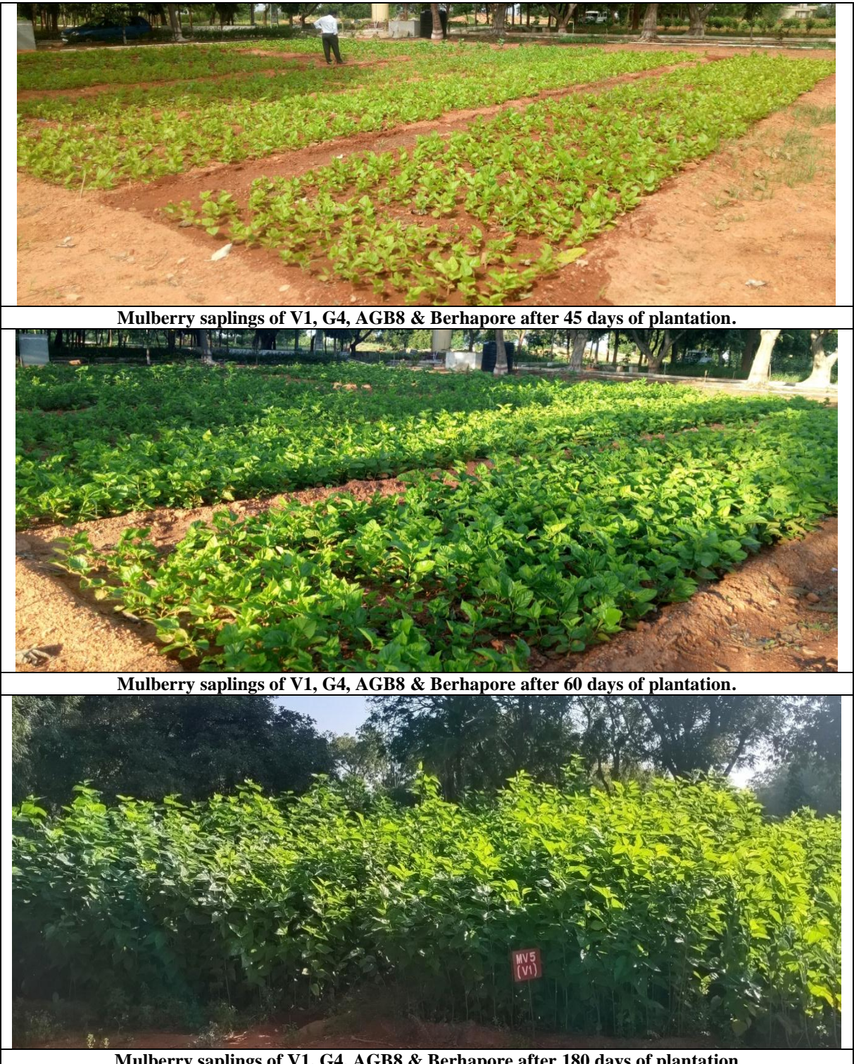
Mulberry saplings of V1, G4, AGB8 & Berhapore after 180 days of plantation Fig. 4: Mulberry saplings of V1, G4, AGB8 & BER varieties growth behaviour at nursery level.

Though all the mulberry varieties (V1, G4, AGB8 & BER) were evolved as high yielding mulberry varieties for the tropical regions of South as well as North Indian Geo-climatic conditions but shown significant variations and diversity at nursery level the reasons may be several (Sudhakar et al. , 2019). Evaluation of mulberry gene pool for important agronomic traits is a pre-requisite for mulberry improvement. Breeders always concerned with the selection of superior genotypes which performance is