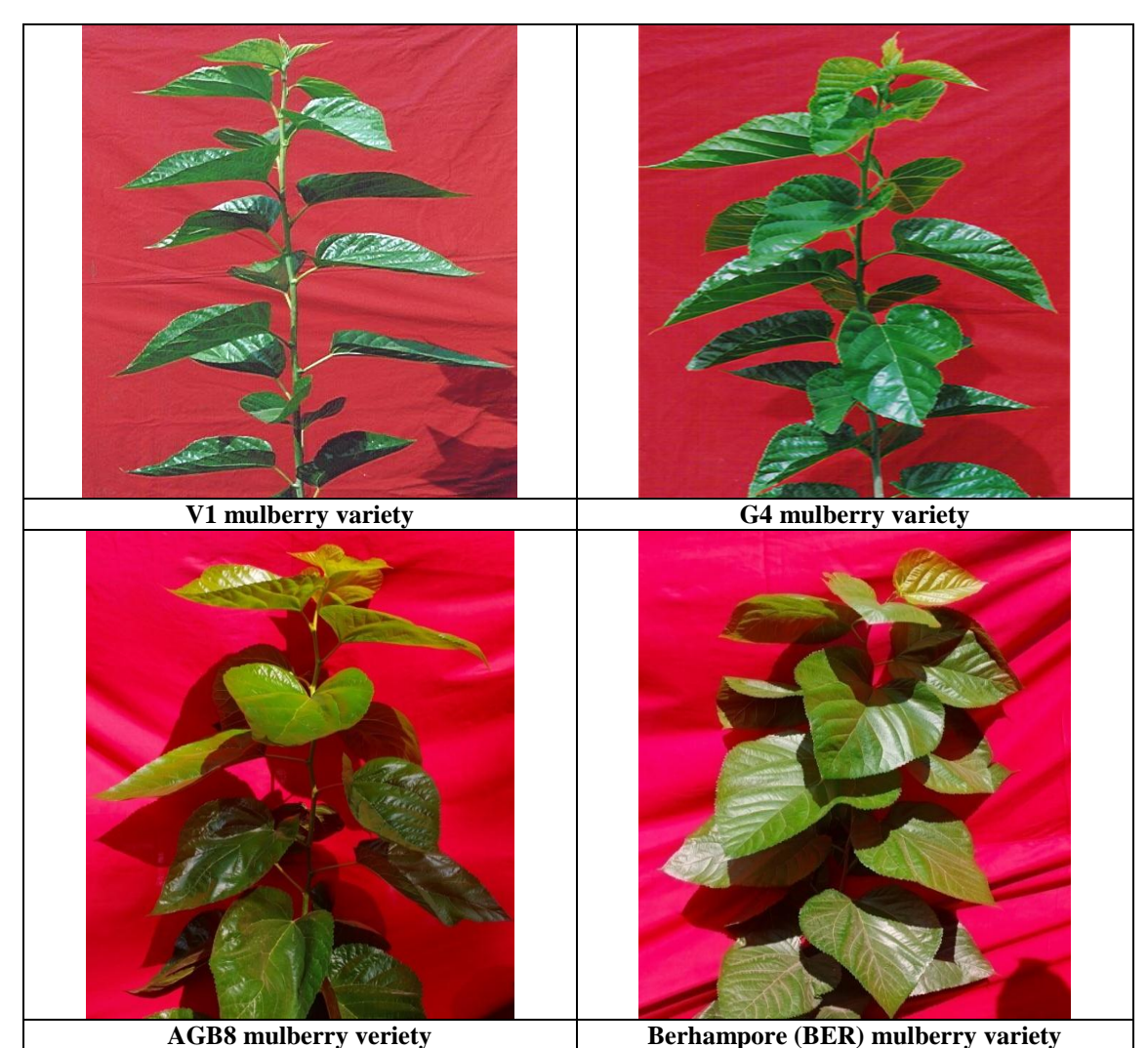
Fig. 1: Morphological appearance of V1, G4, AGB8 and Berhampore (BER) mulberry varieties.

Indian. Though AGB8 & BER varieties have shown their superiority in recording higher leaf size, plant height and root, shoot biomass but failed to record their superiority in recording increased levels of leaf moisture, MRC, profuse rooting, sprouting and survival of the saplings which are considered as the prime factors for recommending any variety for the adoption at farmers level.