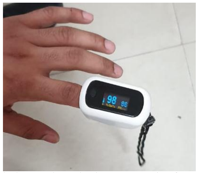
Figure 2: Figure showing thevital signs status at the time of observation.