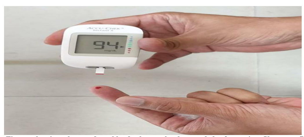
Figure 1: Figure showing the random blood glucose level recorded after using Varam reflexo-stump footwearand waiting observational period (Final RBS).