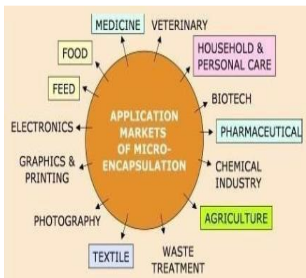
Fig. 9: Applications of microencapsulation

There are many reasons why drugs and related chemicals have been microencapsulated. The technology has been used widely in the design of controlled release and sustained release dosage forms. [23-25]