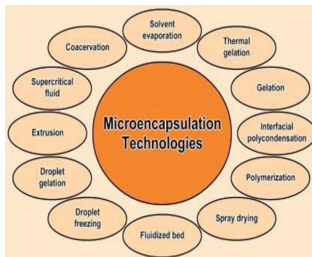
Fig. 3: Microencapsulation techniques.