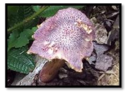
Figure 5: Tricholoma sp.

Fruit body shape Auricularia sp or SAD refer to as tendewontelingoskirtin the form of corrugated sheetswith a weight of 2-8 g and has a hood fruit (pileus) were slick with a diameter of 2-5 cm. Color hood (pileus) Auricularia off-white and brown. The shape of blades (gills) intercalcated in one series and bumpy with tipe grow Auriculariathat is directly attached to the timber (instititious) and does not have a well annulus volva. Based on the characteristics described, this fungus is one of the genus Auricularia. Mushrooms Auricularia included in the family Auricularialesceae of the class Agaricomycetes.