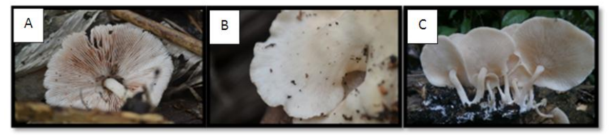
Figure 2: a). Pleurotusostreatus,b). Pleurotussp c) Pleurotuscystidiosus.

flat surface. Pileus margin (cup edge) with the type of plicate (pleated), while the surface of the hood has a type glabrous (smoth) and the lamella arrangement of type pores (sponge like). Stalk (stipe) Favolussp at the center (central) with a cylindrical shape and the surface of the stalk stalks glabrous (smoth). Type Favolus sp grown on substrates that is directly attached to the timber (institious) and does not have the annular or volva. Based on the characteristics described, this fungus is a fungus of the genus Favolus. Mushrooms Polyporaceae Favolus included in the family of class Basidiomycetes.