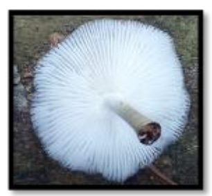
Figure 3: Marasmiellussp.

Pileus margin (cup edge) with the type of entire (smoth), while the surface of the hood has a type glabrous (smoth) and the lamella arrangement of type intercalcated in two seris. Stalk (stipe) Pleurotus have stalks at the center (central) with a cylindrical shape and the surface of the stalk stalks glabrous (smoth). Type Pleurotus grown on substrates that is directly attached to the timber (institious) and does not have the annular or volva. Based on the characteristics described, this fungus is a fungus of the genus Pleurotus.