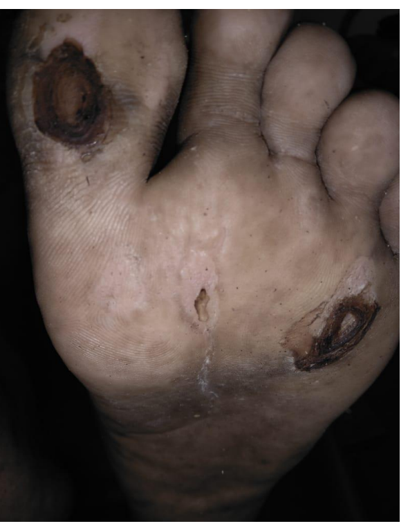
AFTER 10 DAYS OF TREATMENT

Guna : Ruksha, Laghu Veerya : Sheeta Vipaka : Katu