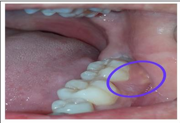
Fig 2: Pre-Operative Procedure.