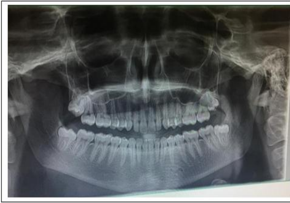
Fig 1: OPG.