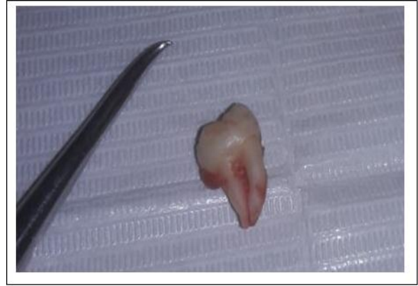
Fig 4: Extraction of 3 rd Molar.