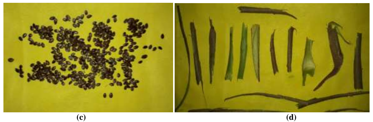
Fig. 1: (a)flowers; (b)leaves; (c)seeds; (d)bark.