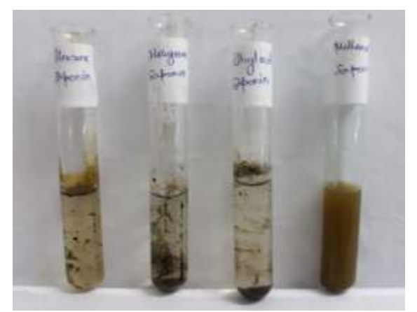
Fig. 9: Test for Saponin.

One gram of each extract was boiled with 5ml distilled water and filtered. To the filtrate, 3 ml of distilled water was further added and shaken vigorously for another five minutes. Frothing with persisted warming was taken as an evidence for the presence of saponins.