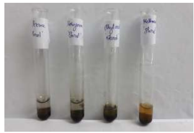
Fig. 4: Test for Sterol.

Chloroform solution of the extract with few drops of acetic anhydride and 1ml of conc. H2SO4 from the side gives reddish ring at the junction of two layers.