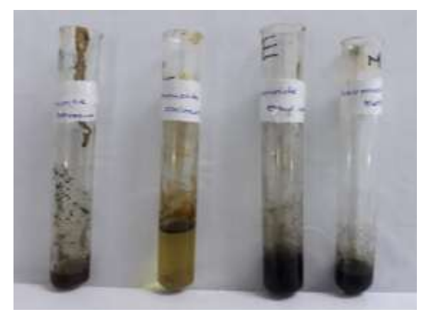
Fig. 8: Test for Flavonoids.

About 0.5 gm of each extract was boiled with 5ml of distilled water and then filtered. To 2ml of this filtrate, add few drops of 10% ferric chloride solution was added. A green-blue colour or violet colour indicated the presence of a phenolic hydroxyl group.