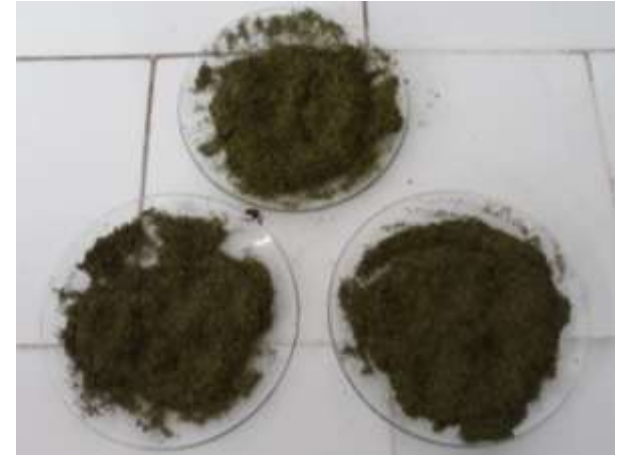
Fig. 2: Powdered leaves.