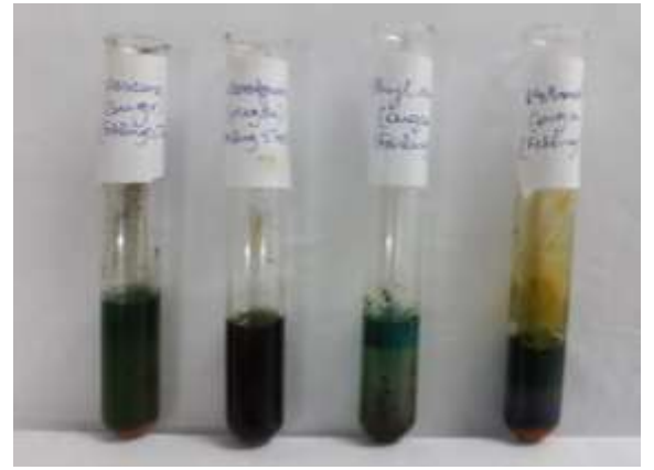
Fig. 7: Test for Sugar.