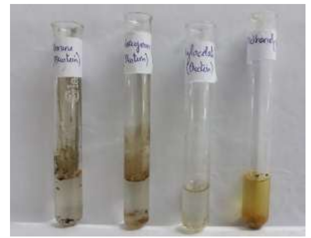
Fig. 6: Test for Protein.

A few milligrams of plant extracts was dissolved in 2ml of water and conc. HNO<sub>3</sub> was added in it. Yellow colour indicates the presence of protein.