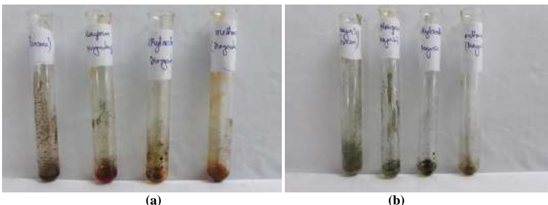
Fig. 3: Test for alkaloids: (a)Dragondroff's Test; (b)Meyer's Test.