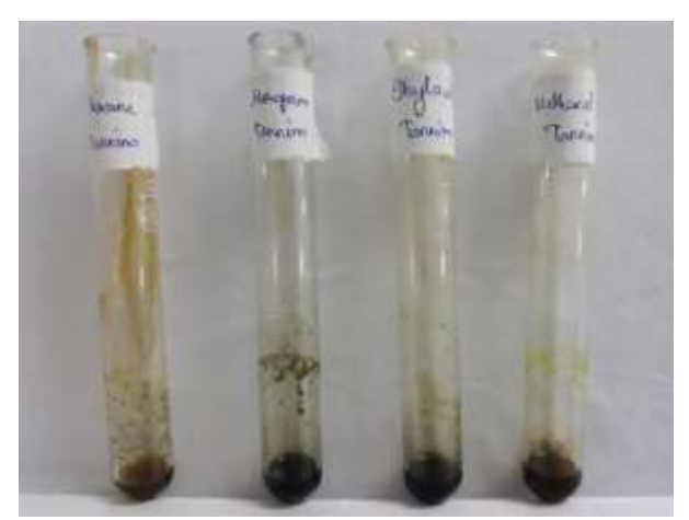
Fig. 5: Ferric Chloride test for Tannins.

Extracts are mixed with few drops of 1% solution of gelatin containing 10% sodium chloride which gives white precipitate.