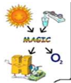
Artificial Leaf Goes Simpler and More Efficient for Solar Fuel Generation