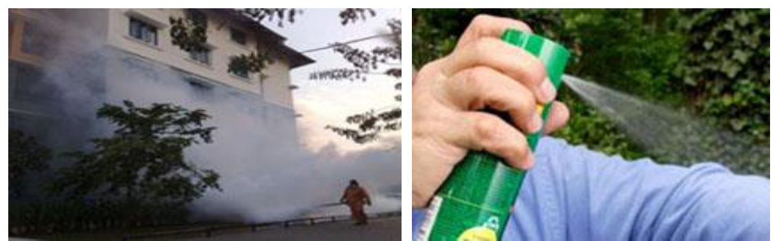
Fig. 3: Zika virus prevention through mosquito control and insect repellent.

Always check the instructions for the particular brand of repellent or sunscreen for guidance on use.