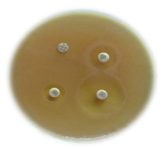
Figure 3: ESBL Detection Test.