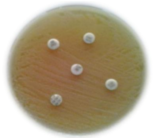
Figure 1: Antibiotic Resistance to cephalosporins antibiotic.