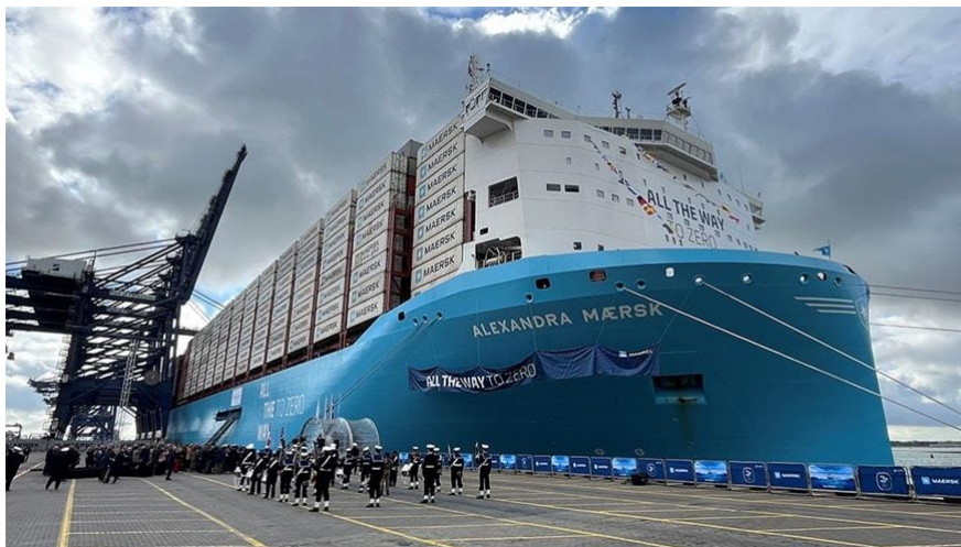
Figure-4: Shipping in Maersk.

Office: India Office: 4th Floor, Jasmine Towers, 401-A/B 402 A/B, 31, Shakespeare Sarani, Kolkata, West Bengal 700017.