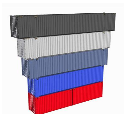
Figure-6: Maersk containers.

Here's a more detailed look at salary ranges for some Maersk positions in different locations.