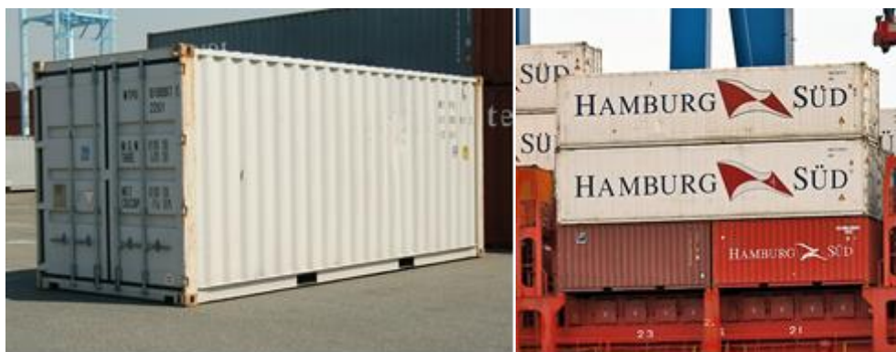
Figure-7: Container sizes.

Capacity: Maersk Line is a Danish international container shipping company and the largest operating subsidiary of Maersk, a Danish business conglomerate. Founded in 1928, it is the world's second largest container shipping company by both fleet size and cargo capacity, offering regular services to 374 ports in 116 countries. As of 2024, it employed over 100,000 people. Maersk Line operates over 700 vessels and has a total