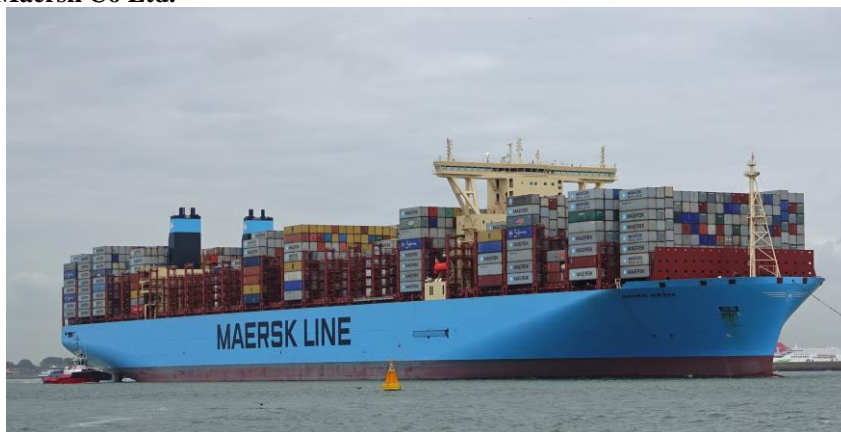
Figure-5: Shipment of Maersk.