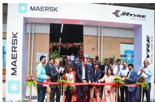
Figure-10: Maersk head office [Denmark & Kolkata].

The company is based in Copenhagen, Denmark, with subsidiaries and offices across 130 countries and over 100,000 employees worldwide in 2024.