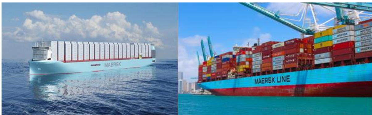
Figure-9: Maersk shipment delivery.

automotive parts to perishable goods like fruits and vegetables, as well as specialized items requiring temperature control or specific handling.