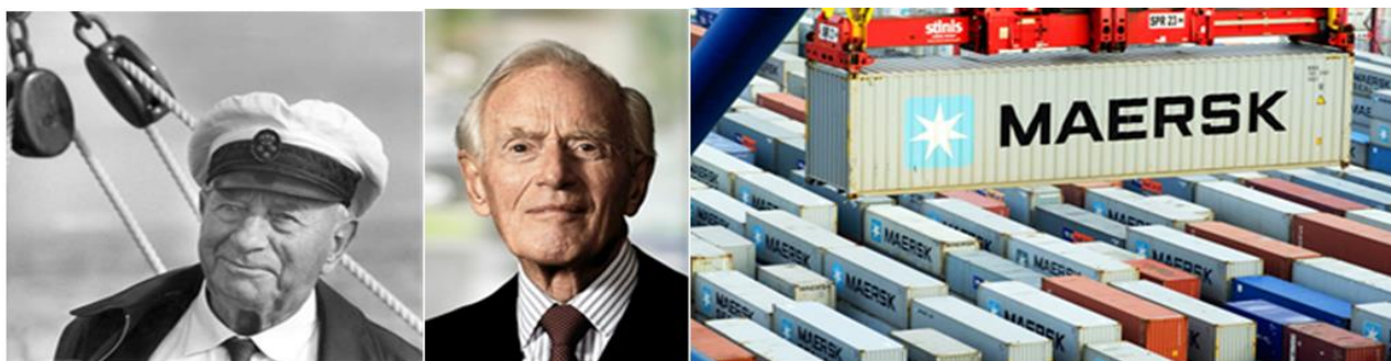
Figure-1: Maersk owners with cargo.

worldwide in 2024. It is a publicly traded family business, as the company is controlled by the namesake Møller family through holding companies. The company's 2024 annual revenue was US$55.5 billion. Maersk has faced several challenges, including the global economic downturn, a malware attack, and the Red Sea crisis.