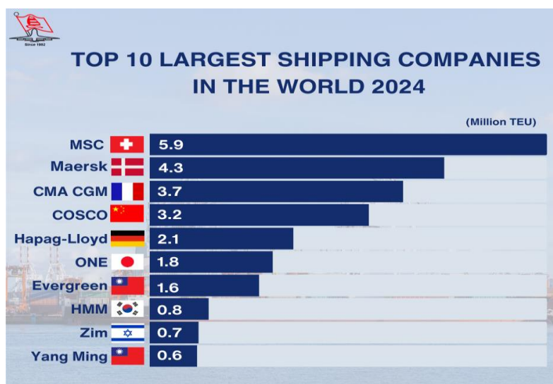
Figure-2: Histogram of shipping company in world.

Pale blue background: This colour is also a consistent element of the Maersk logo, providing a strong visual contrast to the white star.