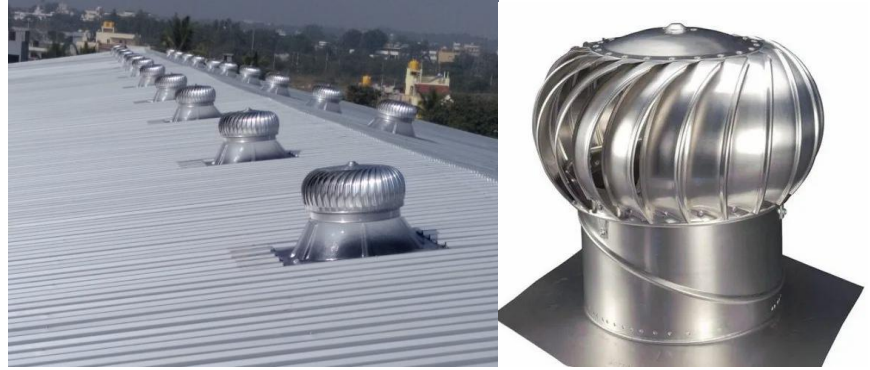
Figure 1: Roof top exhaust fan.

space, escaping through the roof vents. Properly installed roof vents will prevent the roof from overheating. They also prevent condensation of moisture. When the roof overheats or moisture builds up, this can lead to substantial damage or health risks. An exhaust fan is typically installed on a wall and consists of a propeller fan. When switched on, the fan blades start spinning, drawing air from the room into the fan housing. This creates a pressure difference, forcing the collected air to move outside through a duct or vent.