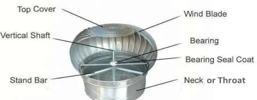
Figure 4: Roof exhaust.

American Society of Heating, Refrigerating, and Air-Conditioning Engineers. It's a professional organization that develops and publishes standards and guidelines for HVAC&R systems, indoor air quality, and building energy efficiency. Industrial fans are a major asset for businesses within a wide range of industries as they help with their heating and cooling needs, including transportation, manufacturing, and construction. Exhaust fans are essential for maintaining the air quality and temperature of homes and commercial spaces. They