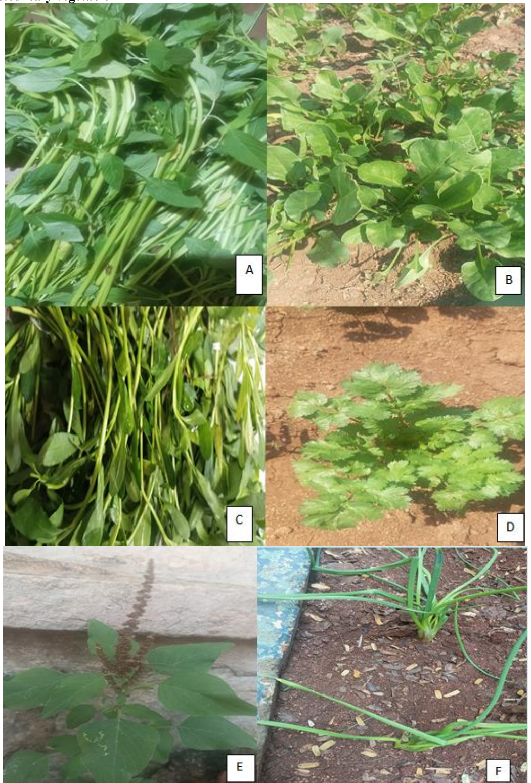
Figure 2: A. Amaranthus retroflexus L., B. Spinacia oleracea L, C. Alternanthera sessilis (L.) R.Br. ex DC., D. Coriandrum sativum L., E. Amaranthus viridis L., F. Allium fistulosum L.

www.wjpls.org Vol 11, Issue 6, 2025. ISO 9001:2015 Certified Journal 236