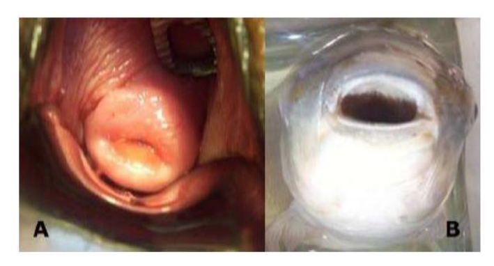
Figure No 1: (A) Cervix of multiparous woman (B) Mouth of Rohita fish.

The uterus is a hollow pyriform muscular organ situated in the pelvis between the bladder in front and the rectum behind.<sup>[12]</sup> The cervix is spindle shaped, bounded above by the internal os and below by external os. The external os is circular in a nulliparous woman, but gets split during delivery, resulting in the formation of anterior and posterior lips.<sup>[13]</sup> This appearance of external os is somewhat similar to Rohita matsya mukha which is described in classics.