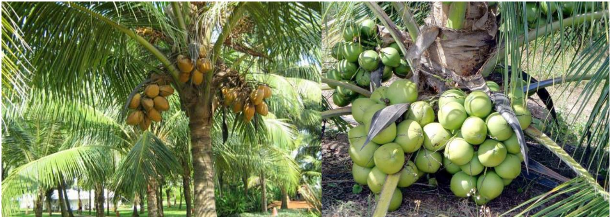
Figure-4: Evergreen coconut garden.