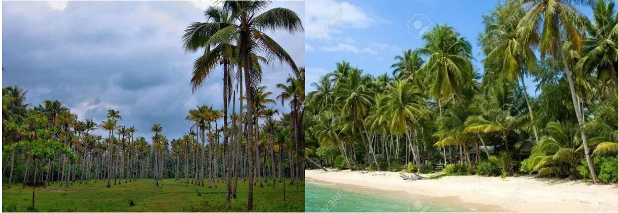
Figure 7: Indian coastal region where coconut plantation is done.