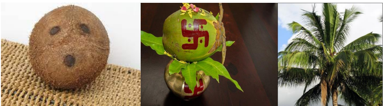
Figure-5: Ripe coconut with three hole, green coconut in kalash and tree.

If you want to enjoy the tender, creamy coconut meat, buy a slightly mature green coconut. It will give you a little less water but plenty of coconut meat. You can enjoy this meat as it is or use it to make shakes, smoothies, or desserts.