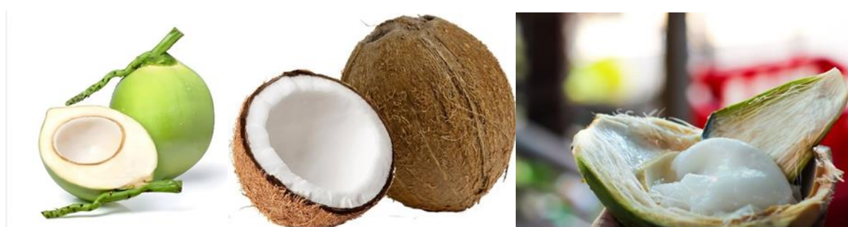
Figure-2: Green and Ripe coconut.

protein and total fat content under 1% each. Green Coconut has much water and is rich in proteins, minerals, vitamins, calcium, phosphorus, iron, iodine, chlorine, sulphur, potassium, magnesium, carbohydrates and vitamins B1, B2 as well as B5. The water also helps the hydration of the body. Apart from their cooling taste, green coconuts are rich in nutrients. Green coconuts are valued for their hydrating water, while red coconuts are prized for their thicker, more substantial meat. Ultimately, the choice between red and green coconuts depends on individual preferences and the specific purpose for which they're being used. The water from green coconuts, often referred to as "green coconut water" or "young coconut water," is prized for its refreshing and thirst-quenching properties.