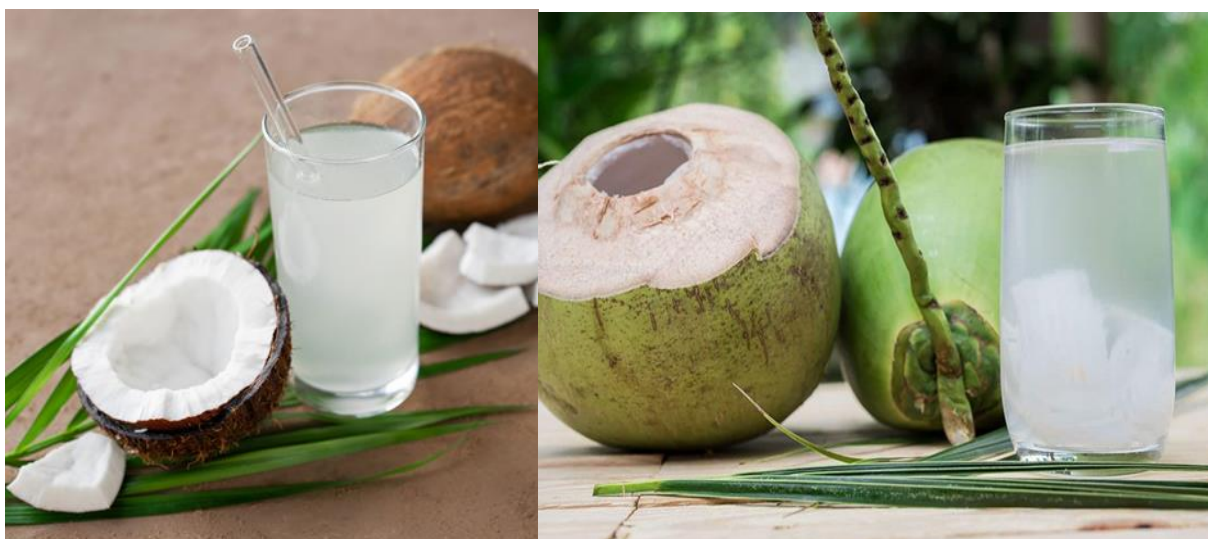
Figure-3: Coconut water [ripe & green].

polyphenol oxidase (PPO). Polyphenol oxidase (PPO; also polyphenol oxidase, chloroplastic), an enzyme involved in fruit browning, is a tetramer that contains four atoms of copper per molecule. PPO may accept monophenols and/or o-diphenols as substrates. The enzyme works by catalysing the o-hydroxylation of monophenol molecules in which the benzene ring contains a single hydroxyl substituent to o-diphenols (phenol molecules containing two hydroxyl substituents at the 1, 2 positions, with no carbon between). It can also further catalyse the oxidation of o-diphenols to produce o-quinones. PPO catalyses the rapid polymerization of o-quinones to produce black, brown or red pigments (polyphenols) that cause fruit browning.