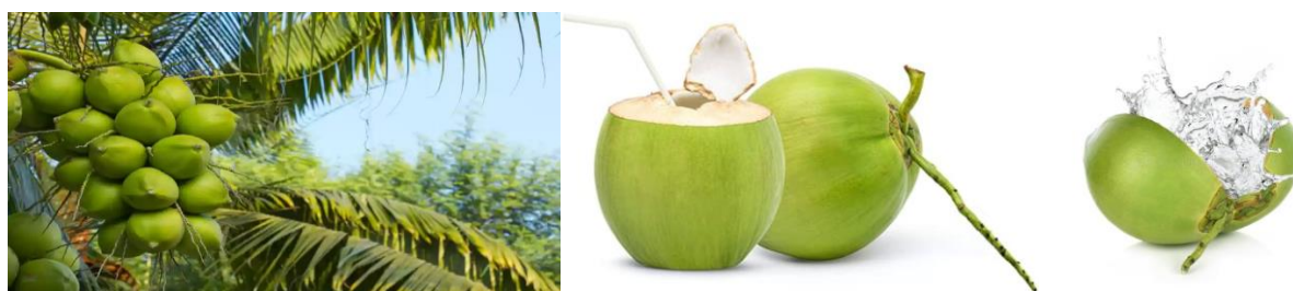
Figure-1: Green coconut.

antioxidants and their flesh also contains healthy fatty acids that aid brain function. Coconut water is rich in electrolytes, such as potassium and sodium, which can help replenish lost fluids and electrolytes due to dehydration. However, it's important to note that coconut water may not be as effective as ORS in cases of severe dehydration or when diarrhoea and fluid loss are substantial.