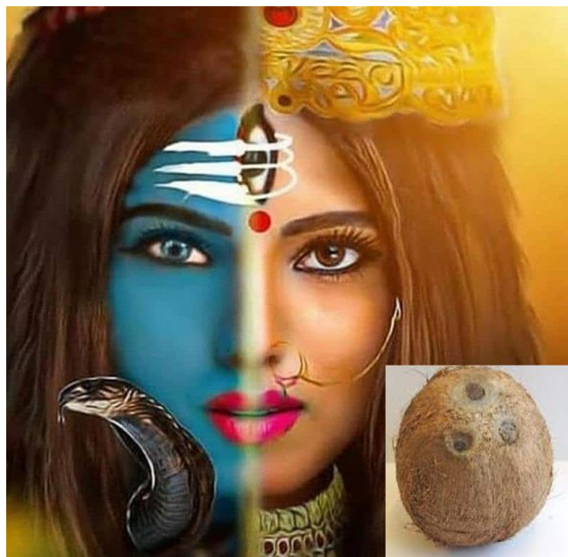
Figure-6: Trinayan symbolises three eyes of coconut.

Ramayana, the Mahabharata and the Puranas. The three eyes of their greatest god, Lord Shiva, are thought to be represented by the coconut among Hindus. The coconut also symbolizes a noble and proud heart, with its tough shell on the outside and sweet, delicate fruit on the inside. The three marks on the coconut are regarded as the three eyes of the lord Shiva. Some people also consider the three marks as Brahma, Vishnu and Maheshwara. Allegedly, the black shell of coconut represents Lord Karthikeya, white coconut inside signifies Gauri and inside water indicates Ganga.